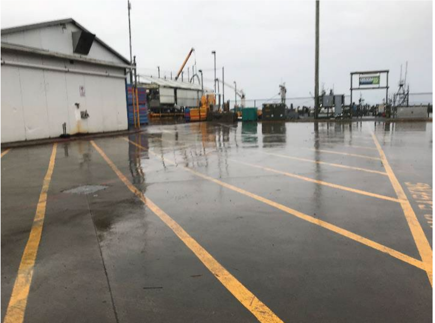
Photo 1: Wash pad engineered to direct comingled storm and process wastewater into the wastewater treatment system permitted under an individual NPDES #WA0041971.

Inspector: Adonia McKinzi Camera: iPhone Permit #WA0041971