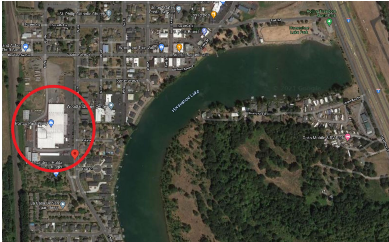
Figure 1: Facility Location Map

Portco Packaging is an existing facility that plans to discharge industrial wastewater to the City of Woodland POTW from a new operation, water-based printing. Portco Packaging is a minor industrial user.