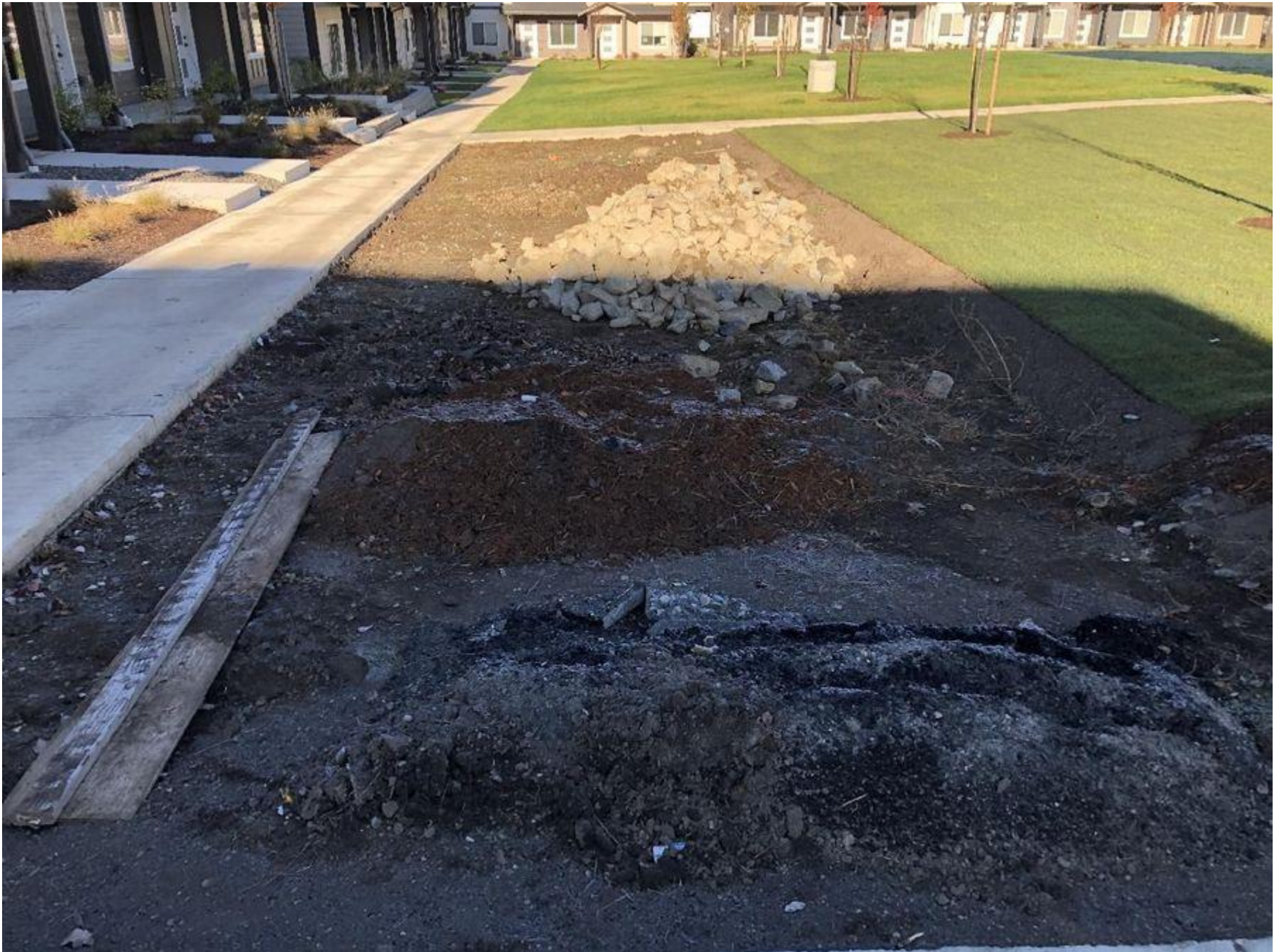
Photo Description: Some areas on site have not been landscaped. Small pile of quarry spalls and asphalt littered dirt pile has not been removed.