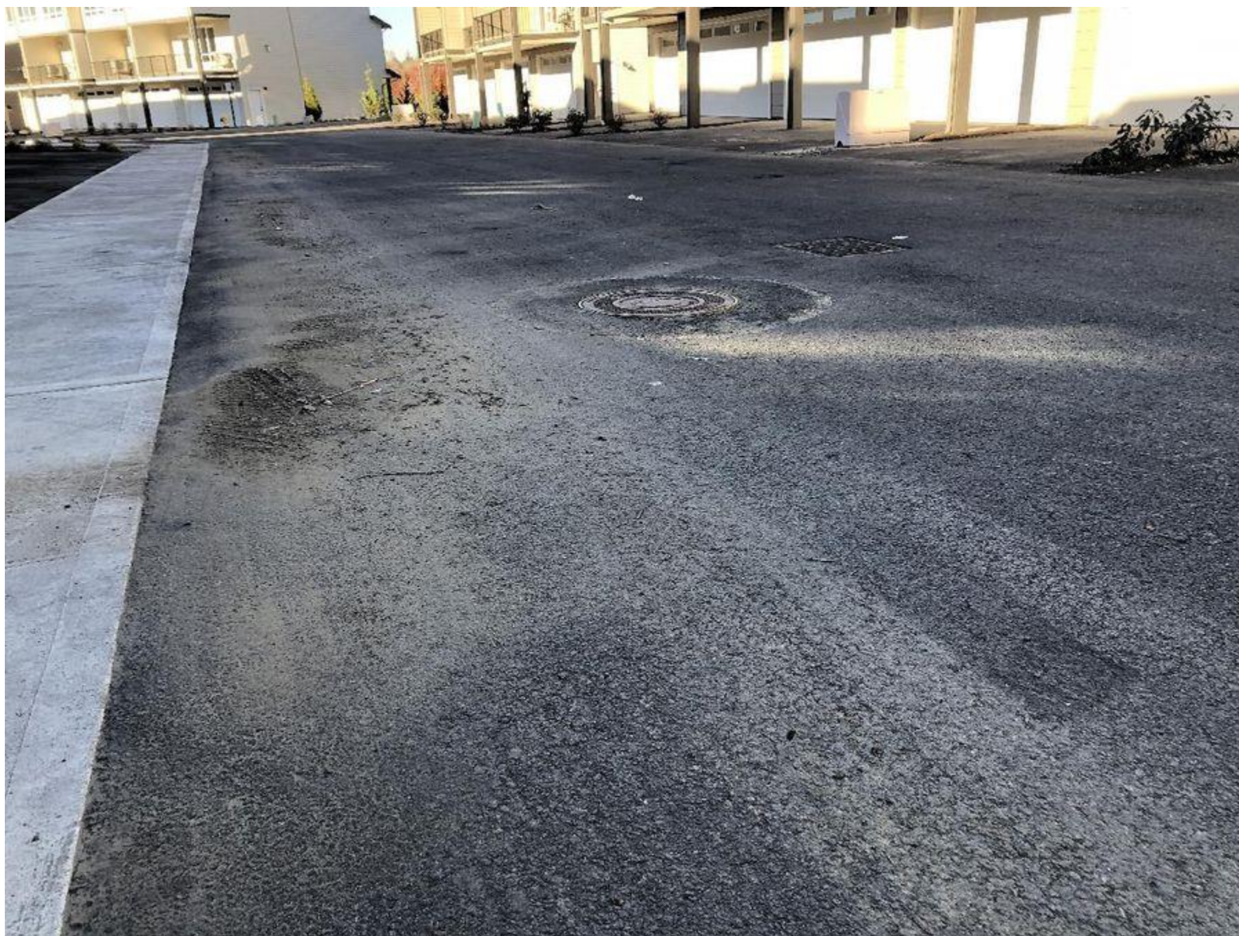
Photo Description: Location of catch basin from Photo 1 . Heavy sediments noted on the street near the catch basin.

Date:2022/11/18 Time:09:56:58 Lat:47.01391666666667 Long:-122.82935277777777 Direction degrees:288.32246376811594