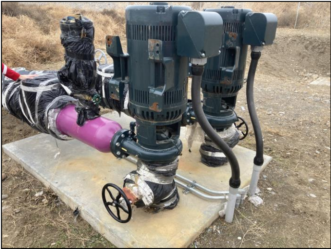
Photo 3. River Point Farms Wastewater Pumps.