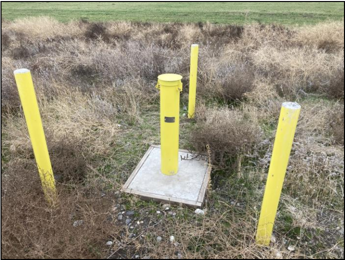
Photo 4. River Point Farms Monitoring Well.