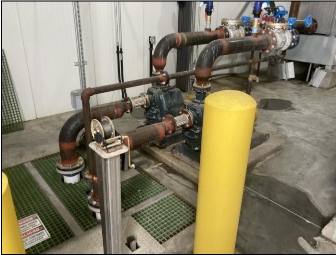
Photo 1. River Point Farms Wastewater Pumps.