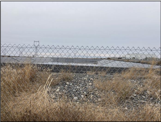
Photo 2. River Point Farms Lagoon.