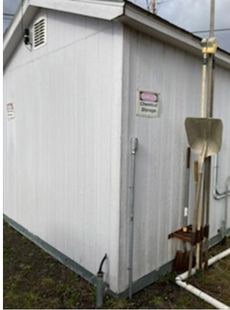
Chemical Storage house