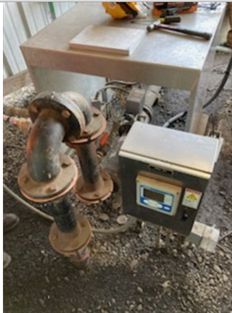
Wastewater discharge pump display screen