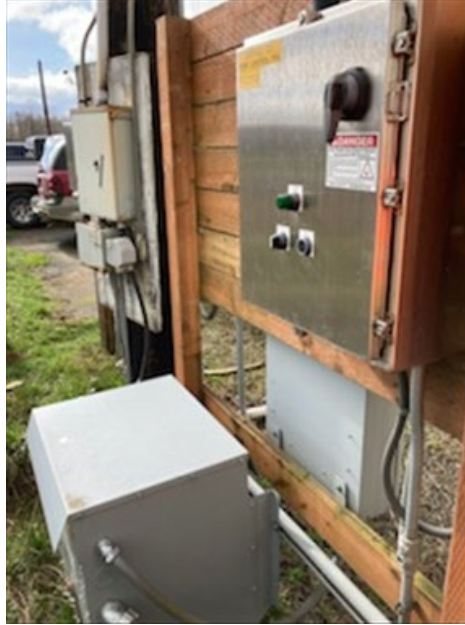
Outfall pump control panel