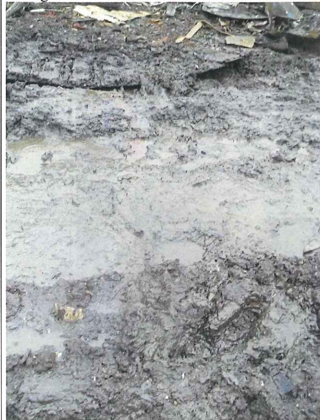
Photo 11 of 12: Sampling point 2 was in the production area where heavy equipment move through the site.