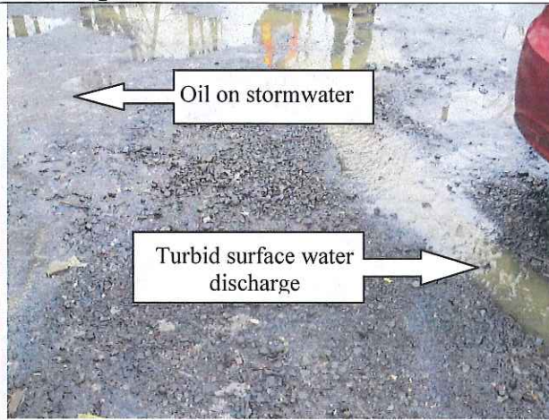
Photo 2 of 12: There was an unreported oily and turbid stormwater discharge from the office area. The facility is reporting No Discharge.