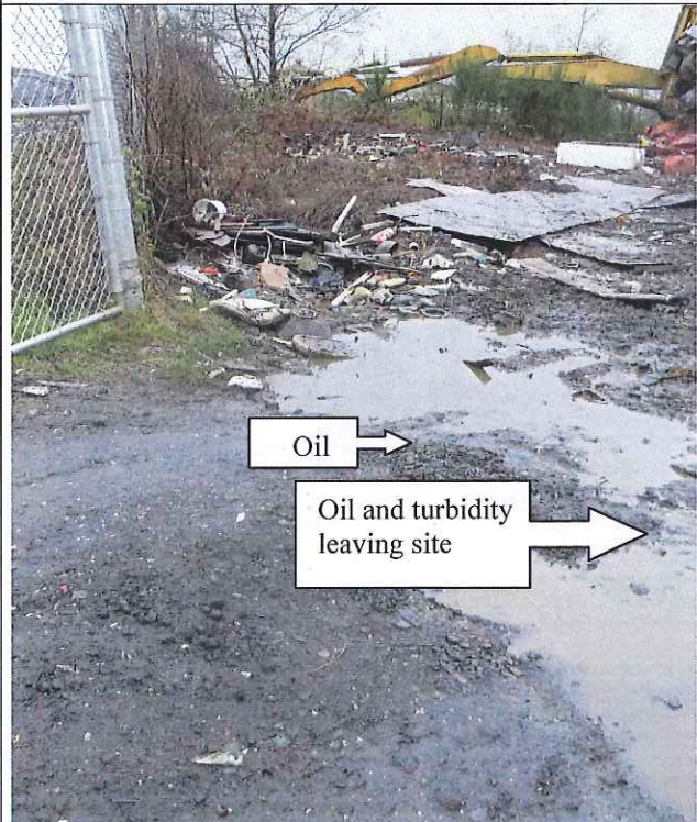
Photo 3 of 12: There is a second unreported surface water discharge from a gate on the east side of the site.