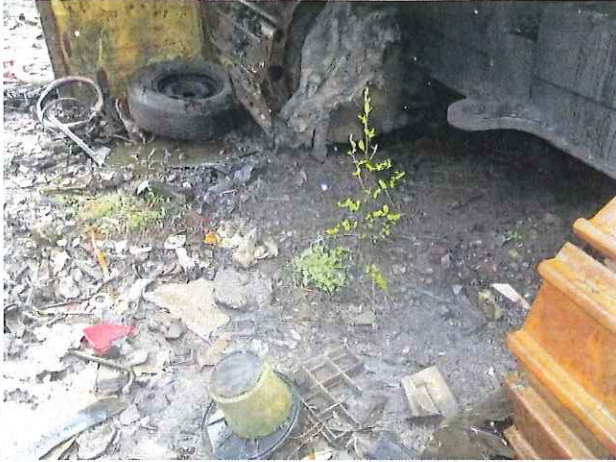
Photo 5 of 12: Equipment not being maintained contaminating soil and stormwater.