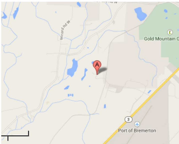
Map indicating location of Olympic View Sanitary Landfill