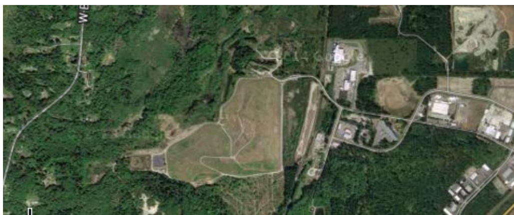
Aerial View of Olympic View Sanitary Landfill