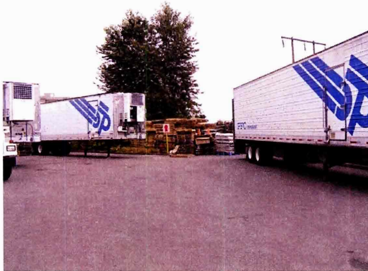
P7250006 DESCRIPTION: STORAGE AREA