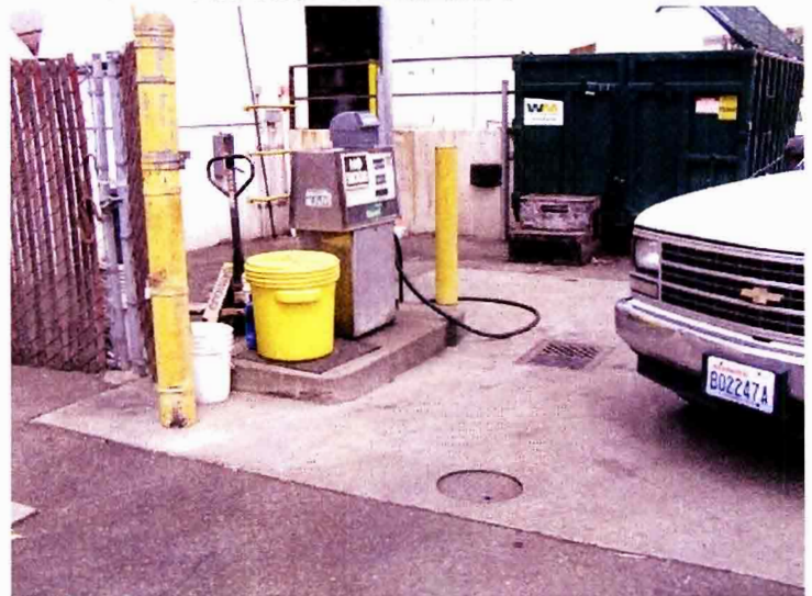
P7250005 DESCRIPTION: FUEL STATION DRAINS TO SANITARY SEWER