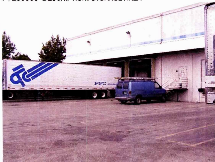
P7250008 DESCRIPTION: LOAD AND UNLOAD (MAIN ACTIVITY) AREA IN FRONT OF BUILDING