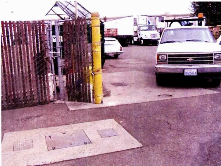
P7250004 DESCRIPTION: OIL AND WATER SEPERATOR