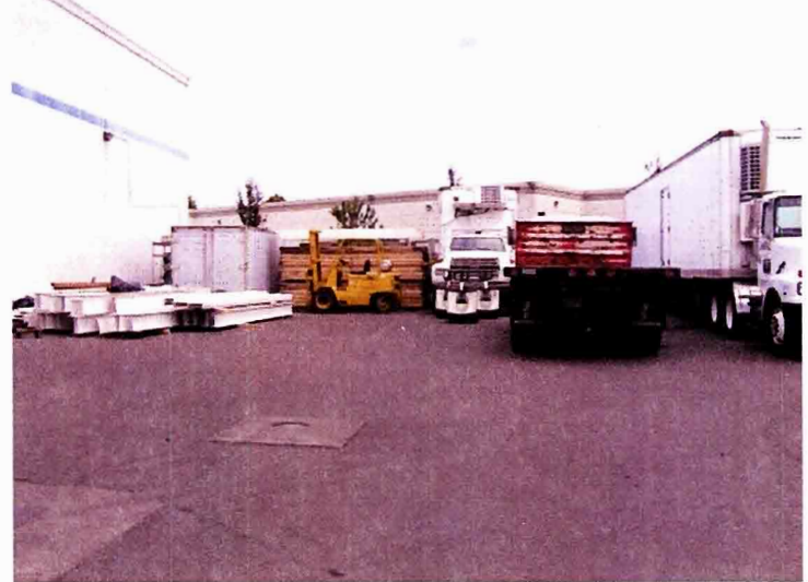
P7250007 DESCRIPTION: TEMPORARY STORAGE AREA