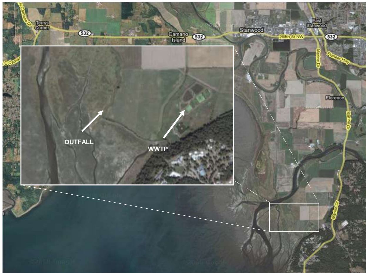
Figure 1. Facility and Outfall Location Map