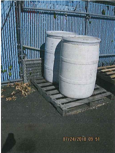
Photo 5 of 6: These two barrels of cleaning fluid are stored outside without containment. They were not leaking.