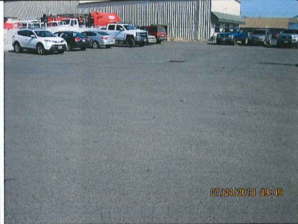
Photo 2 of 6: Employee and customer parking. There is no production in this area.