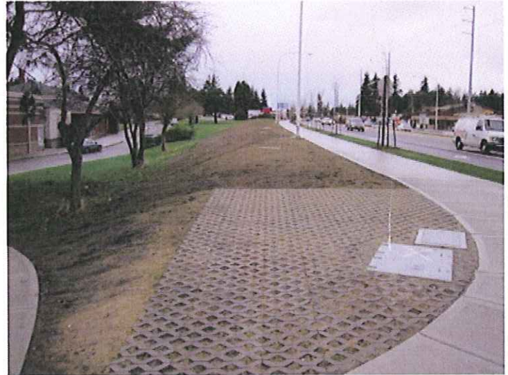
PHOTO #4: HYDROSEED FAILED TO GERMINATE; THIS AREA IS NOT PERMANENTLY STABILIZED; VIOLATION OF PERMIT CONDITION S10.