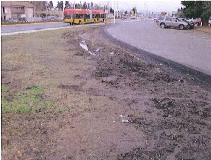
PHOTO #3: SOIL IS UNSTABILIZED AND EXPOSED TO STORMWATER FOR MORE THAN TWO DAYS (DUE TO CARS DRIVING ONTO AREA), ADDITIONALLY GRASS SEED FAILED TO GERMINATE.