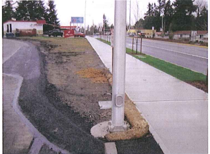
PHOTO #2: HYDROSEED FAILED TO GERMINATE; THIS AREA IS NOT PERMANENTLY STABILIZED; VIOLATION OF PERMIT CONDITION S10.