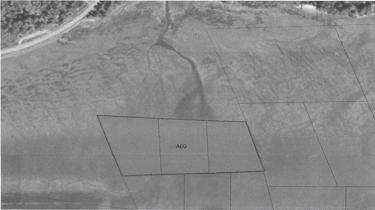
Figure 1-2 shows the locations of proposed japonica treatments for 2020.