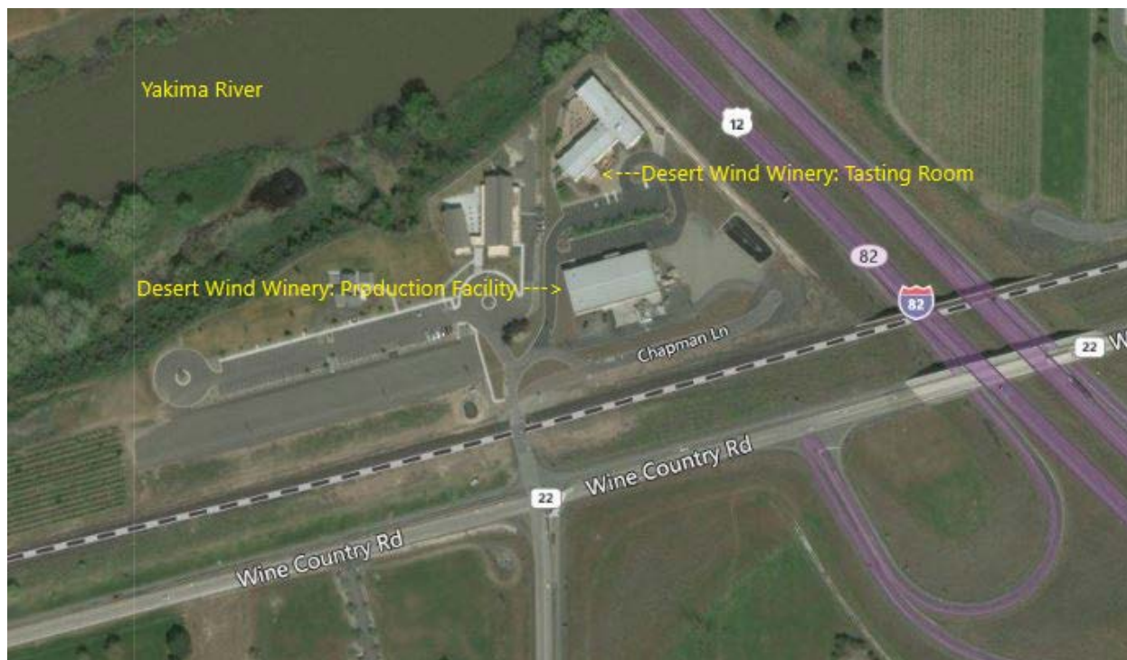
Figure 1 Facility Location Map