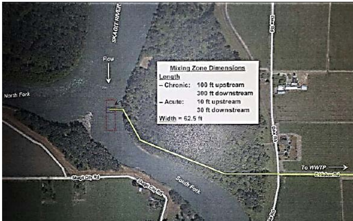
Figure 1: Allowable Dimensions of the Mixing Zone