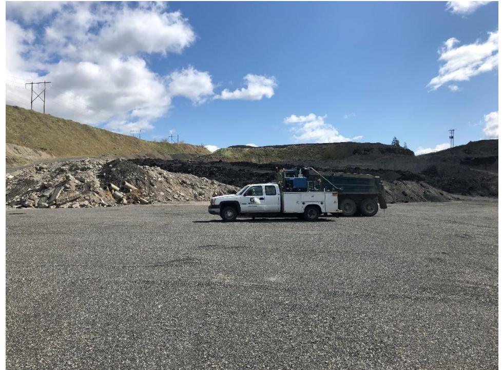
Photo 6 Concrete and asphalt for recycling