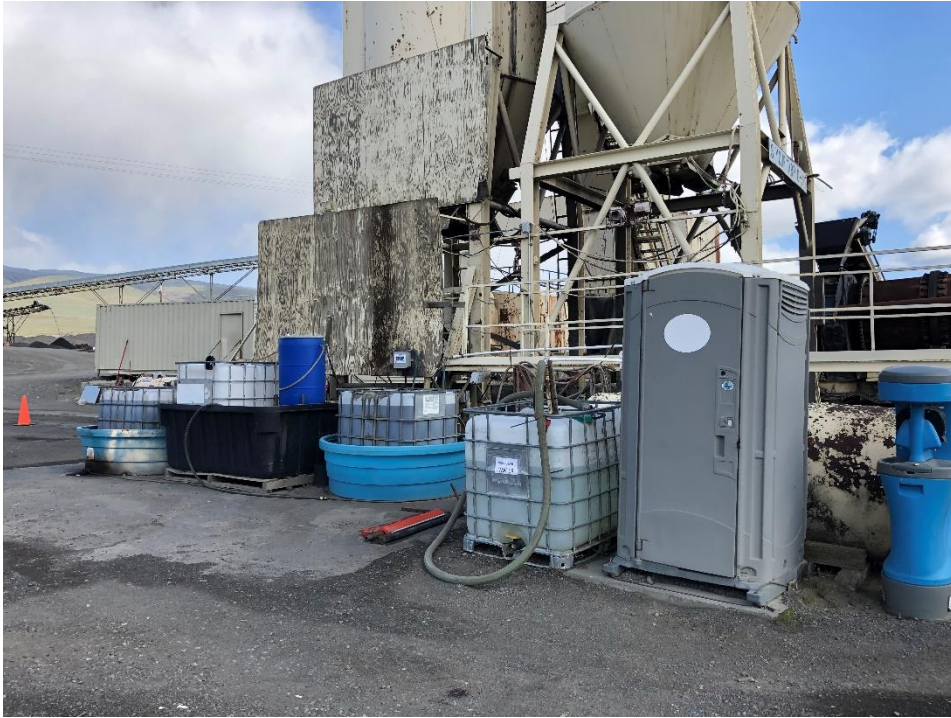
Photo 1 Liquids in secondary containment at the asphalt plant