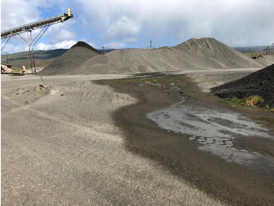
Photo 3 Small puddles from wash plant piles