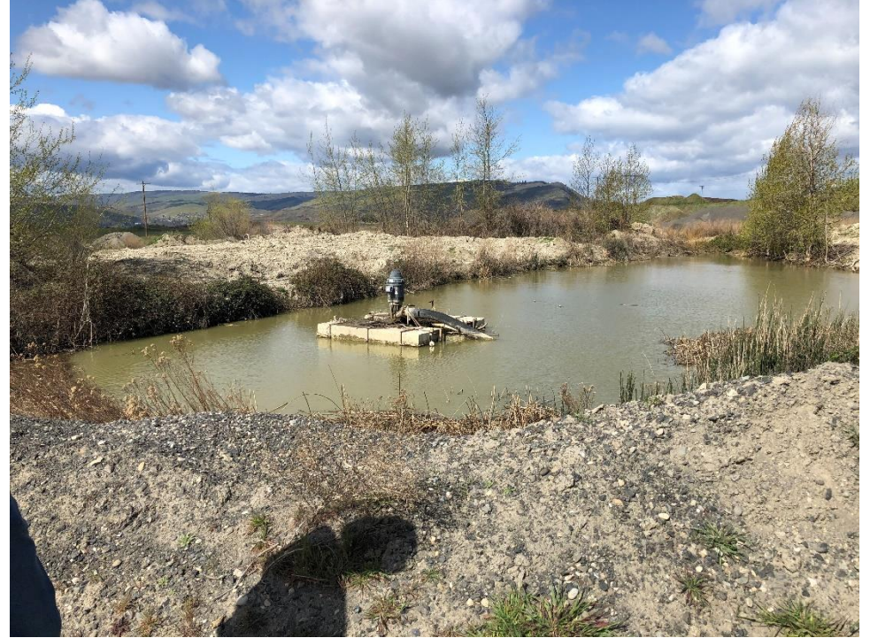
Photo 4 Wash plant pond