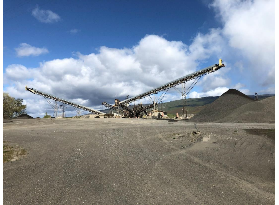
Photo 2 Wash plant