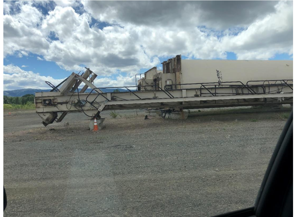
Photo 4 Portable silo