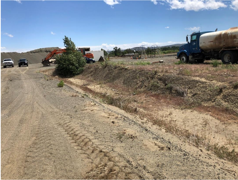
Photo 1 Stormwater containment