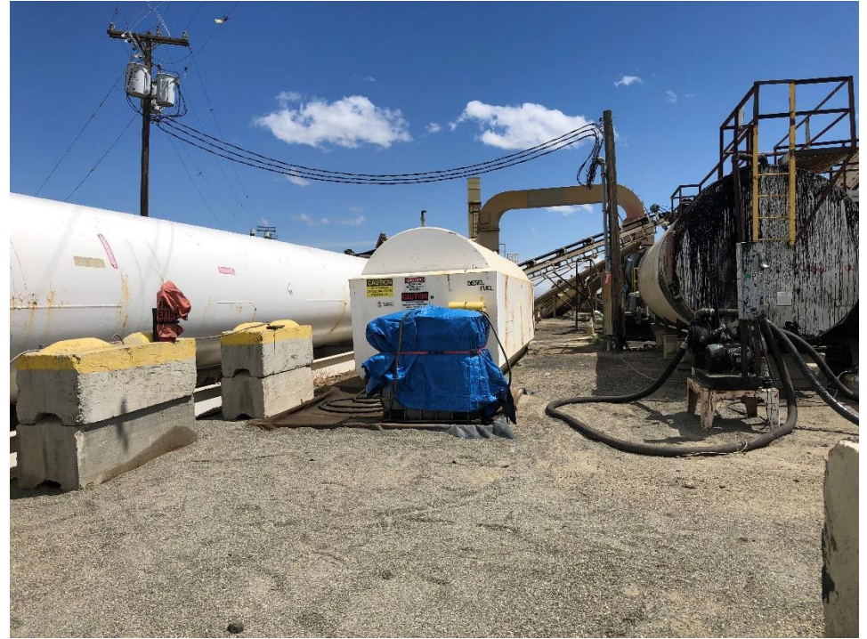
Photo 2 Diesel fuel within secondary containment