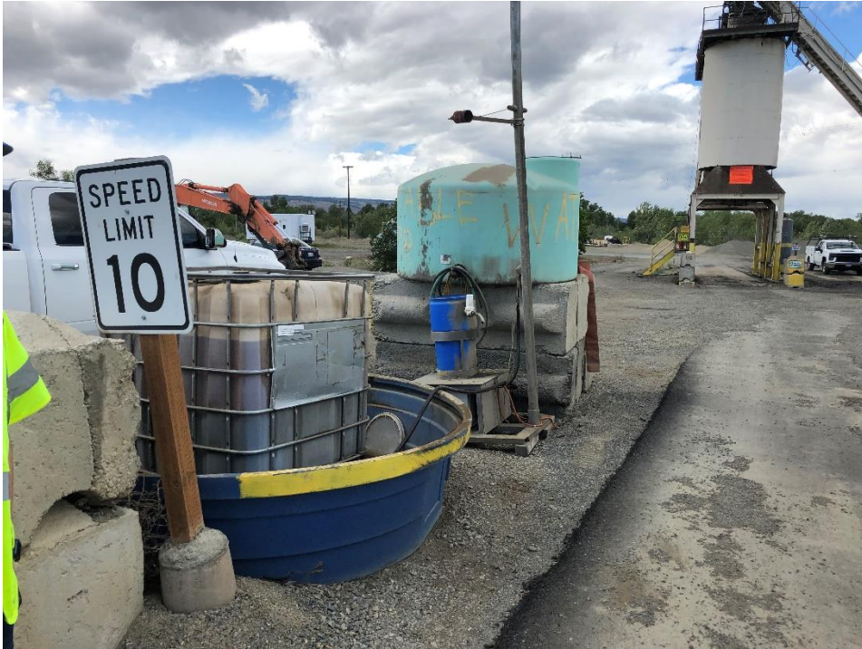
Photo 3 Bed release agent within secondary containment