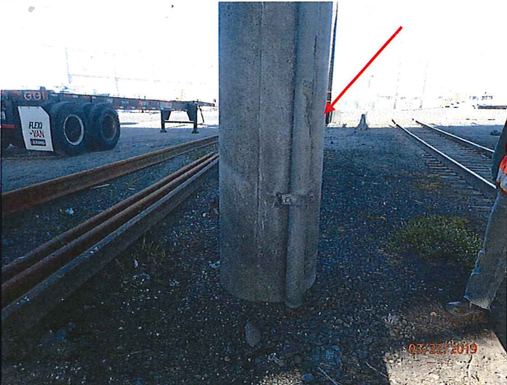
003 DESCRIPTION: DOWNSPOUTS FROM 4 TH AVE OVERPASS DRAIN ONTO THE SITE, CONTRIBUTING TO RUNOFF FROM THE FACILITY PERIMETER.