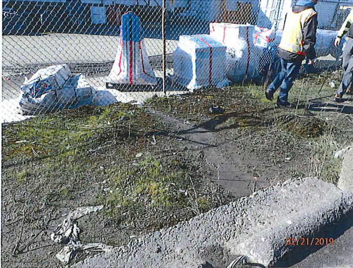
001 DESCRIPTION: PHOTO TAKEN DURING INITIAL 2/21/19 INSPECTION SHOWING EVIDENCE OF TURBID RUNOFF FROM THE PERIMETER OF THE FACILITY.