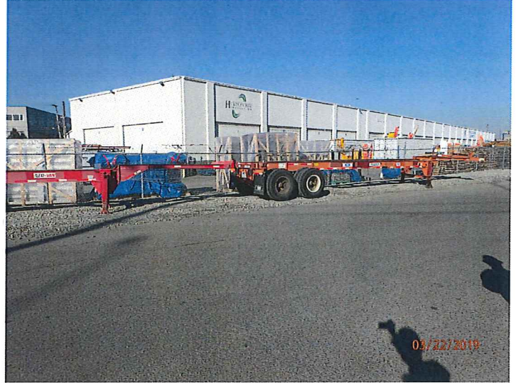
002 DESCRIPTION: GRAVEL ADDED ALONG PORTION OF FACILITY PERIMETER SHOWN IN PHOTO 001 IN AN EFFORT TO RAISE THE GRADE AND PREVENT RUNOFF.