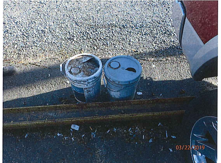
004 DESCRIPTION: TWO FIVE-GALLON PAINT BUCKETS WITH BROKEN LIDS AND NO SECONDARY CONTAINMENT. BUCKETS WERE IMMEDIATELY MOVED OFF THE GROUND.