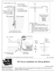
Figure 7.25: Silt Fence Installation by Slicing Method