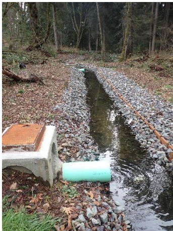
PHOTO 7 FLOW CONTROL AND DISPERSION SYSTEM