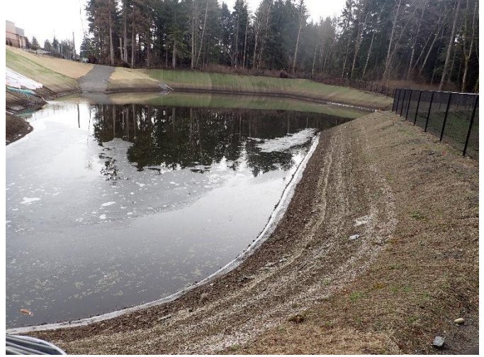
PHOTO 2 VIEW OF THE STORMWATER RETENTION POND (LOOKING EAST). COSTCO STORE ON THE LEFT (TO THE NORTH ACROSS THE STREET)