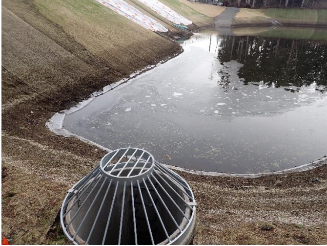
PHOTO 1 VIEW OF THE STORMWATER RETENTION POND (LOOKING EAST), SHOWING OVERFLOW