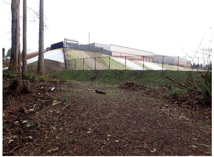
PHOTO 6 VIEW OF THE GRADIENT, LOOKING NORTH.