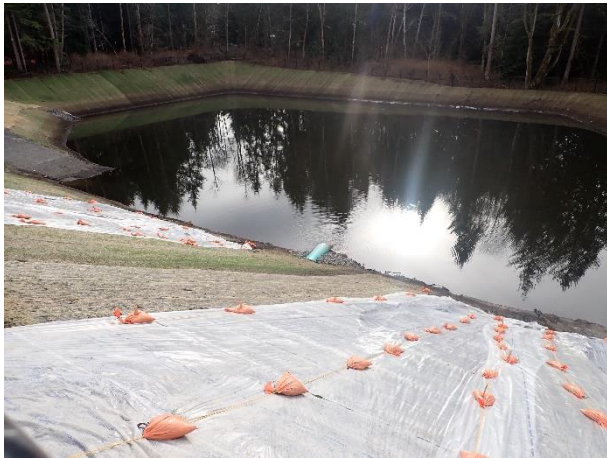
PHOTO 3 STEEP SLOPE SLIDED IN LATE DECEMBER. CONSTRUCTION COMPANY IMPLEMENTED BMP'S TO PROTECT THE SLOPE. HYDROSSEDING WAS APPLIED LAST FALL.