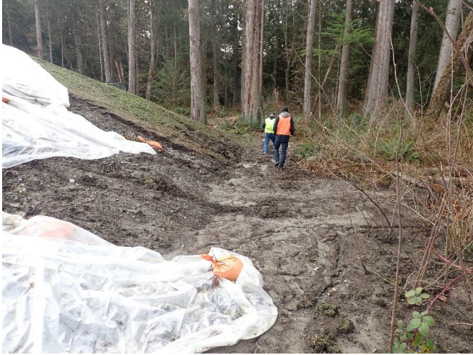
PHOTO 5 EVIDENCE OF EROSION AT THE BOTTOM OF THE SLOPE.