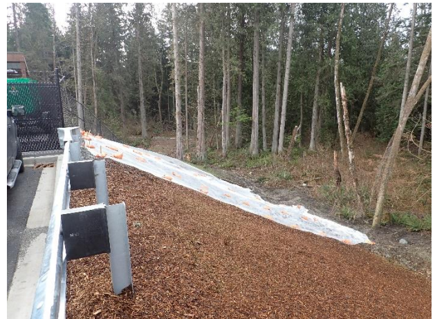
PHOTO 4 WEST SLOPE. THERE IS EVIDENCE AT THE BOTTOM OF THE EROSION OF THE SLOPE. CONSTRUCTION COMPANY APPLIED BARK AND PLASTIC SHEETS FOR EROSION CONTROL.