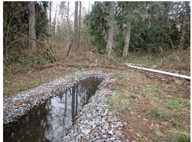
PHOTO 8 FLOW CONTROL AND DISPERSION SYSTEM