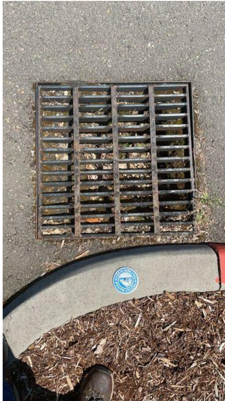
Photo Description: Southeast corner of Early Childhood Education (ECE) building looking east. Pull drain inlet protection.