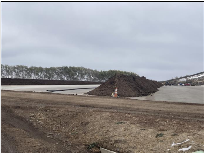
Photo 3. Stemilt Compost Pad.