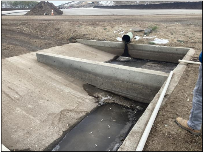
Photo 2. Stemilt Compost Lagoon Settling Basin.