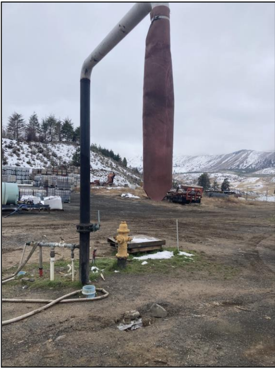
Photo 1. Stemilt Compost Truck Fill Point.