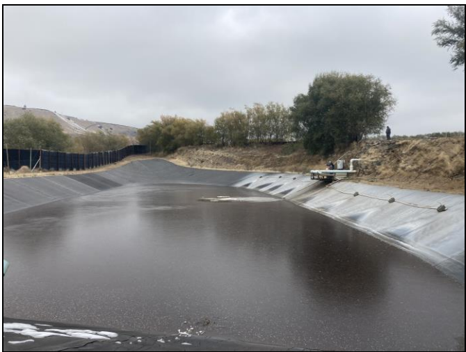
Photo 4. Stemilt Compost Lagoon