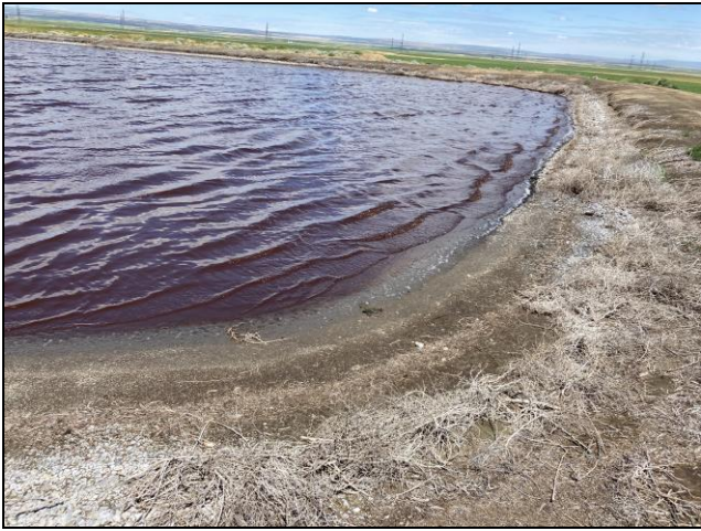
Photo 3. Wastewater lagoon with sludge covering liner.