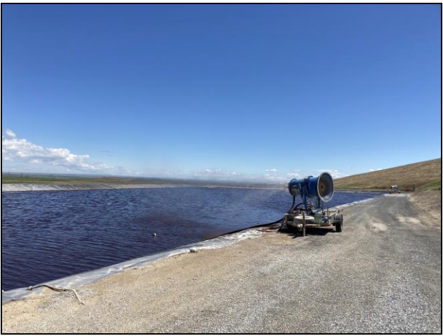
Photo 2. Wastewater lagoon with evaporator.