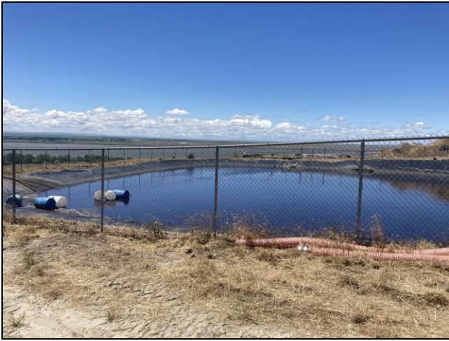
Photo 1. Wastewater lagoon.