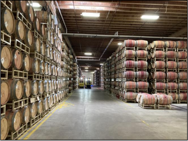
Photo 4. Wine barrel storage.