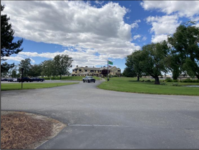
Photo 1. Tasting room.