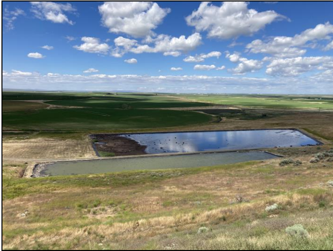
Photo 4. Wastewater lagoons.