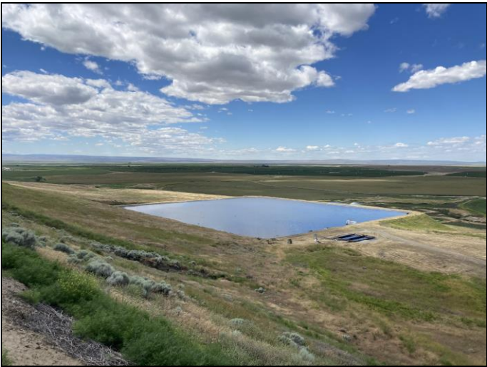
Photo 3. Wastewater lagoons and clarifiers.