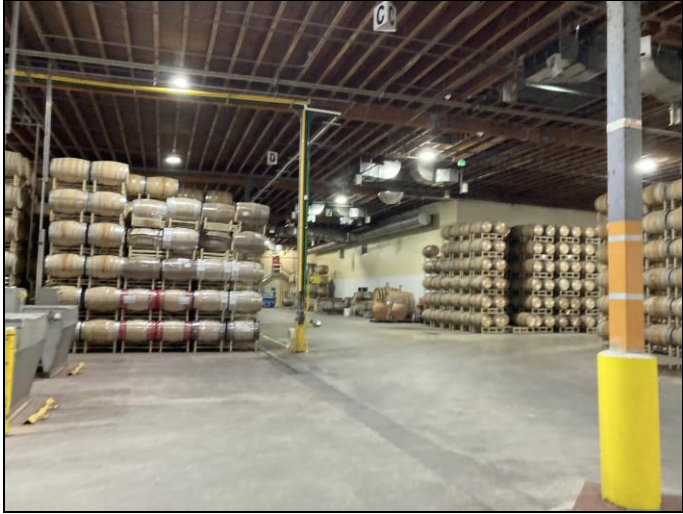
Photo 2. Wine barrel storage.