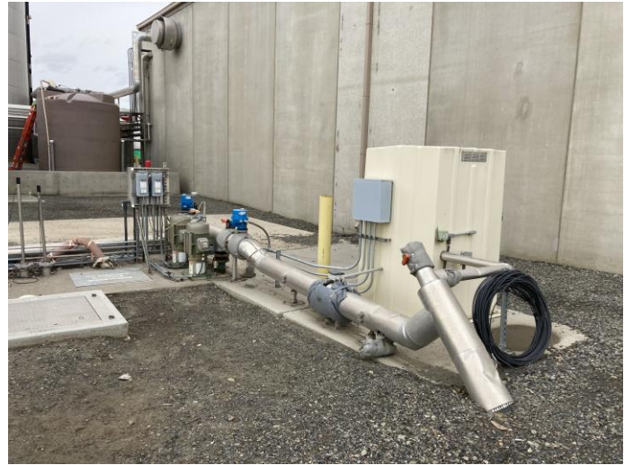
Photo 2. Port of Sunnyside IWWTF Lagoon 4 (Outfall 004) sampling station.