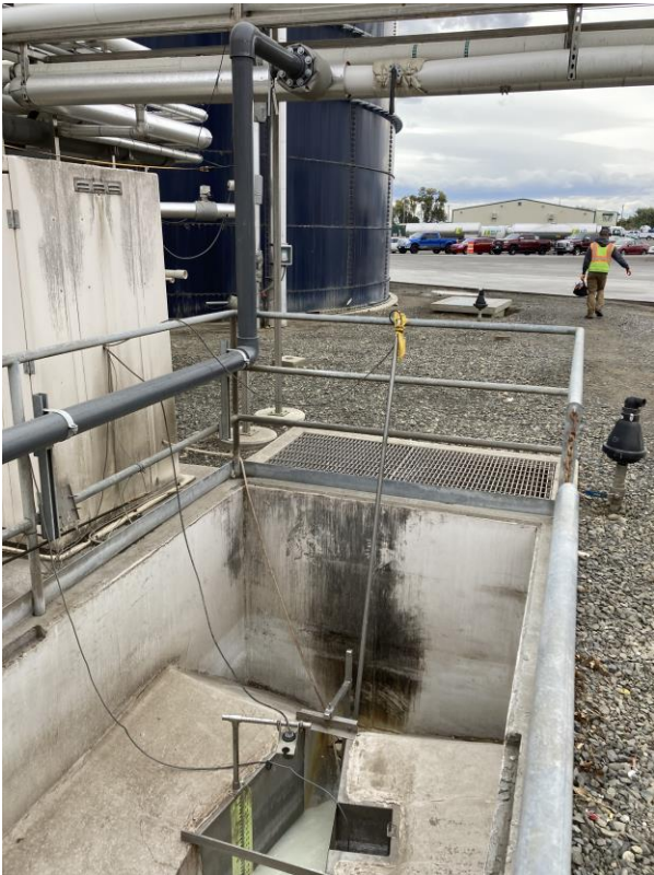
Photo 3. Outfall 002 Port of Sunnyside IWWTF flume and sampling point.