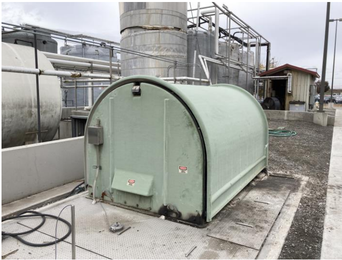
Photo 1. Darigold Sunnyside wastewater infrastructure.