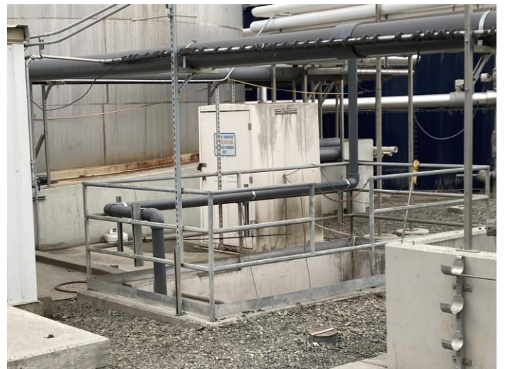
Photo 4. Outfall 002 Port of Sunnyside IWWTF sampling Station next time flume (Photo 3).