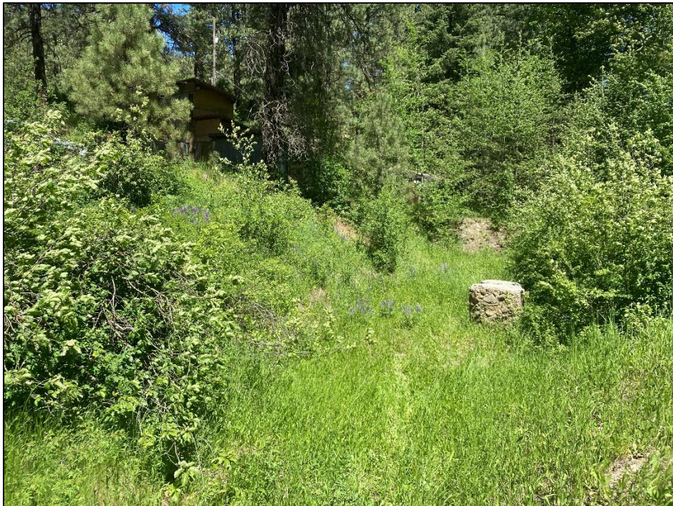
Mill infiltration lagoon near Williams Creek.