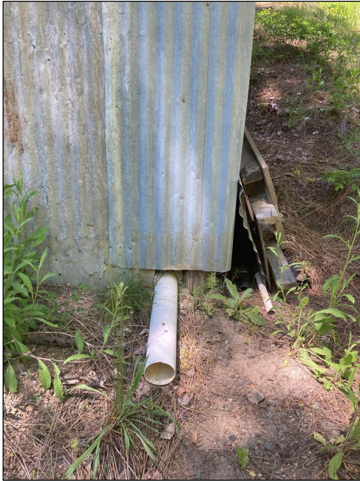
Mill discharge pipe to infiltration lagoon.