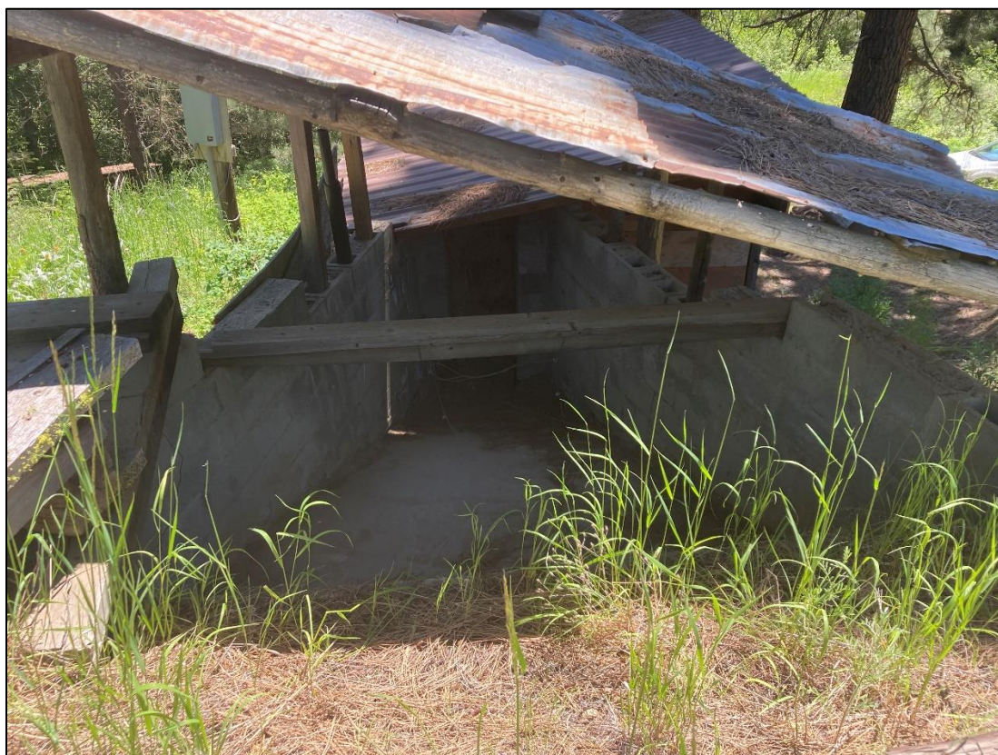
Ore bin and bin gate to crusher.