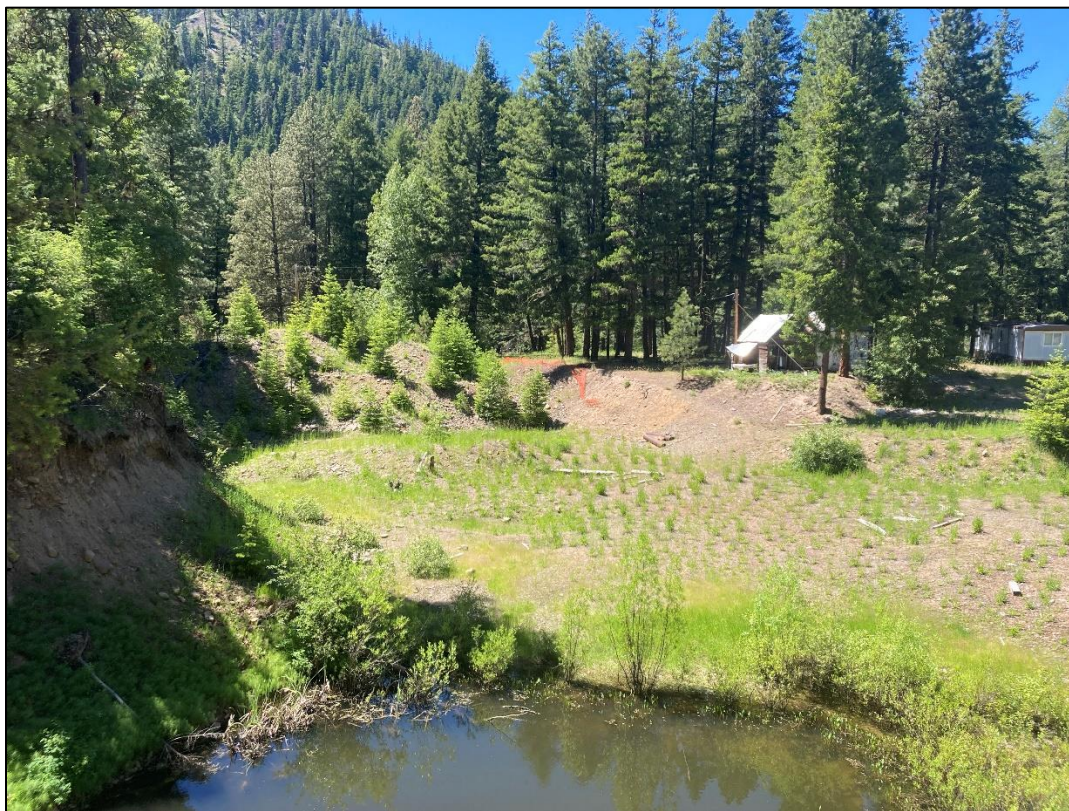
Mining pond and buildings.