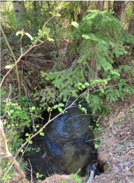
BUTCHER INTAKE (ABOVE ROAD)