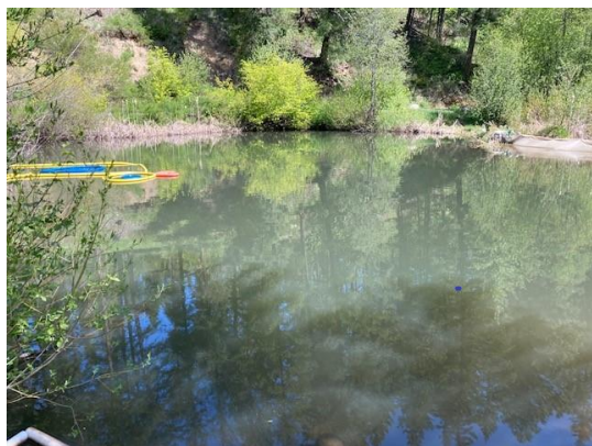
BEAVER ACCLIMATION POND