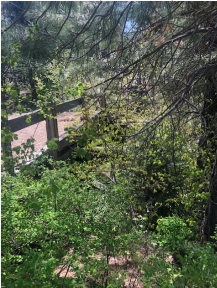
NASON CREEK BELOW OUTFALL (BRIDGE IS BLOCKED FOR ANY USE)