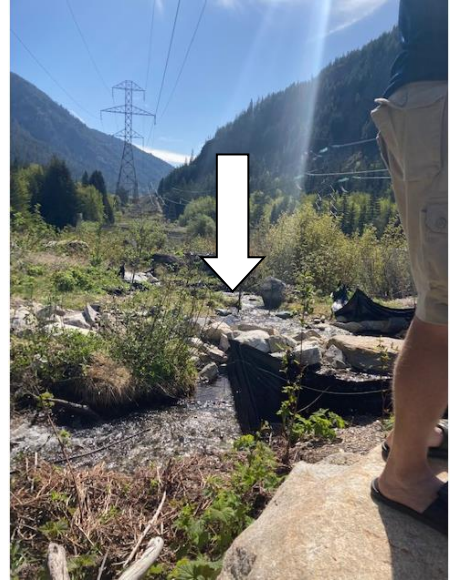
INTAKE NEAR SIDE; ARROW OUTFALL