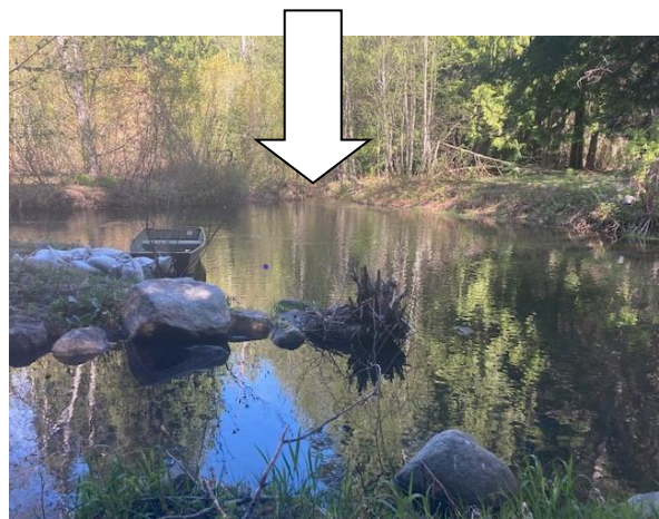
ROHLFING (ARROW IS INTAKE)

1 ST ROHLFING ACCLIMATION SITE (UNNAMED TRIBUTARY (EPHEMERAL WATER) TO NASON CREEK)--