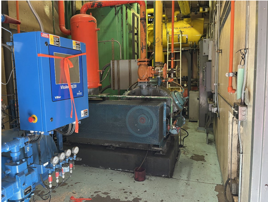
Photo 1 Engine room for CA Storage and cooling.