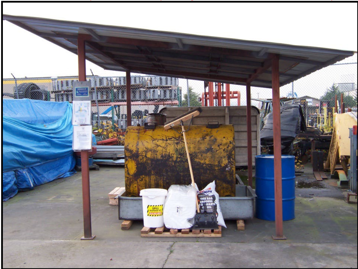
Figure 32 . Waste Storage Area with Spill Kit and Posted Spill Plan.

List the names and telephone numbers of public agencies to contact in the event of a spill.