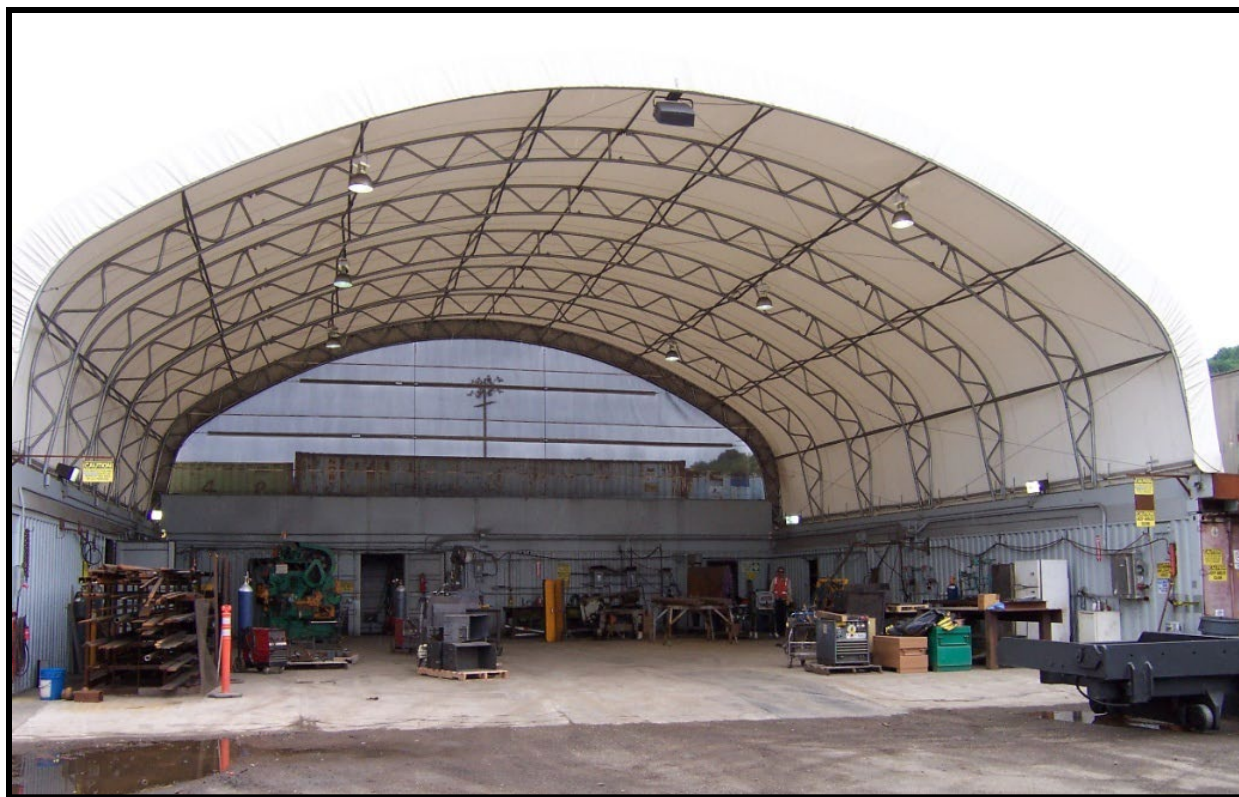
Figure 129. Structure Used To Cover Manufacturing Activities.