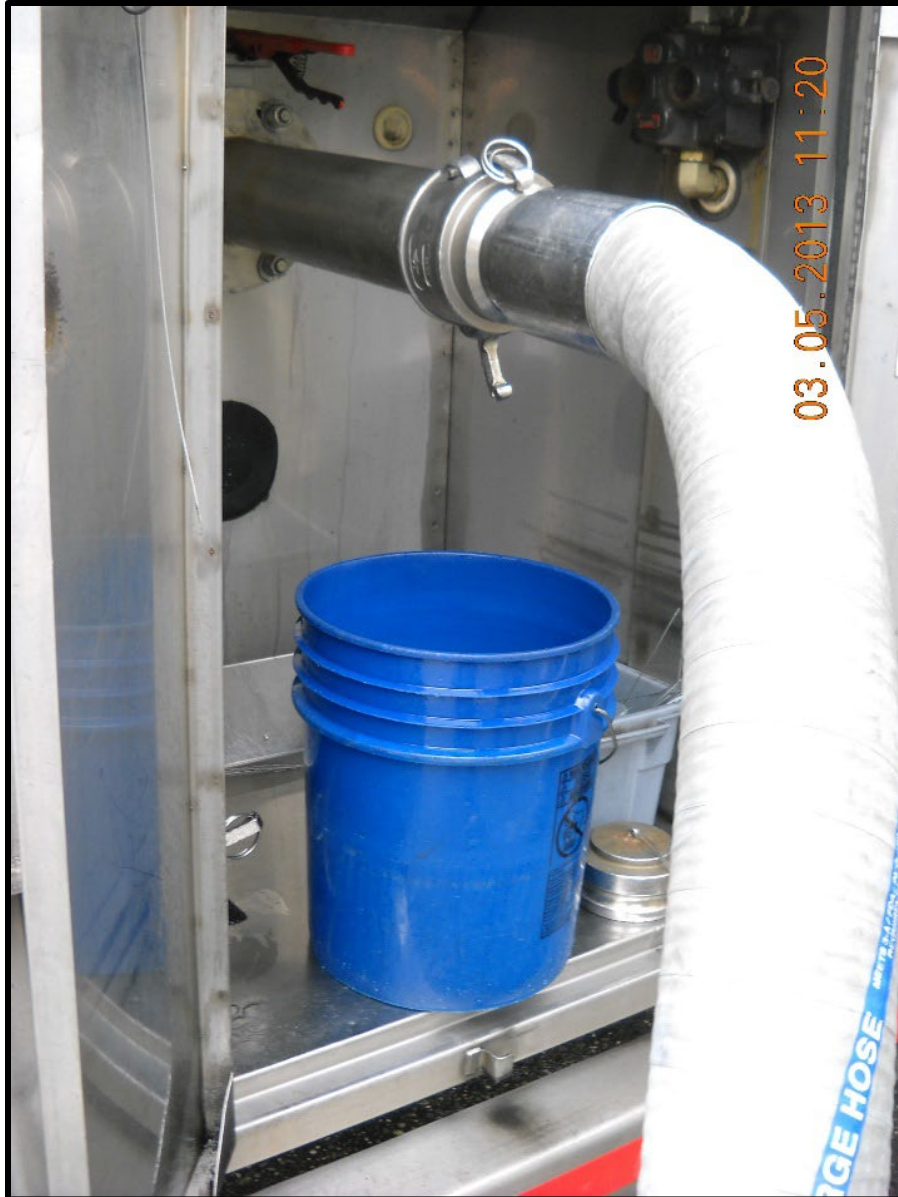
Figure 108. Temporary Containment Device Placed Under a Hose Connection.

The following BMPs or equivalent measures are required in areas of transfer from tanker trucks and railcars to aboveground or underground storage tanks, containers, or between transport vehicles (rail or highway) :