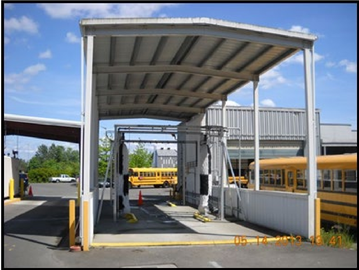
Figure 86. Car Wash Building with Drain to the Sanitary Sewer.