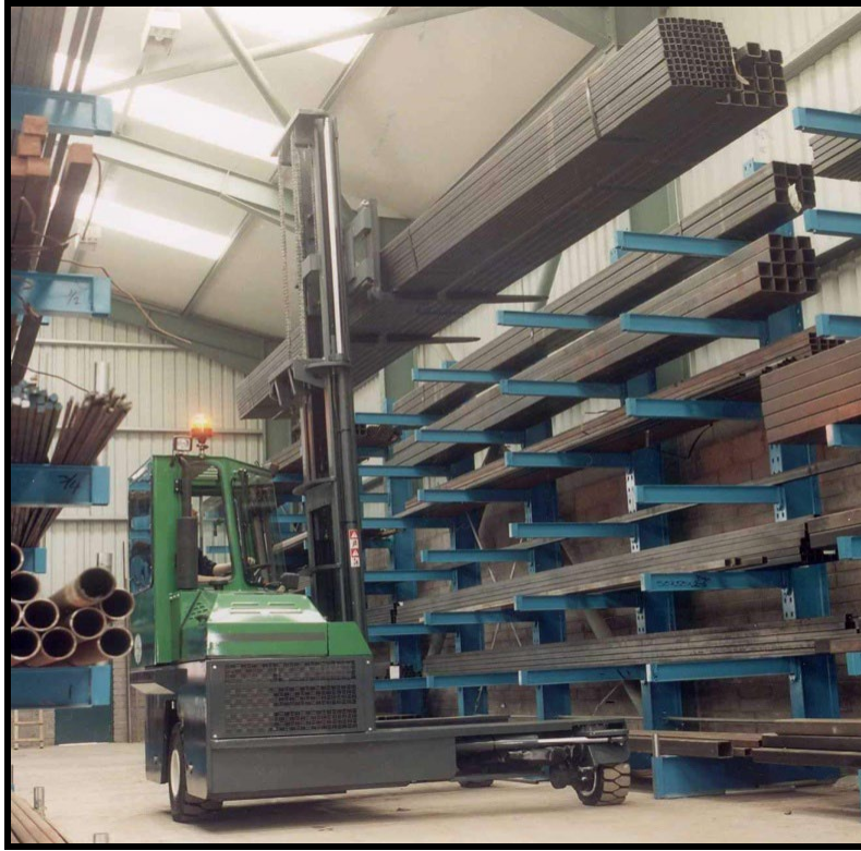
Figure 1 34 . Covered, Paved and Secured Storage Area for Bulk Solids.