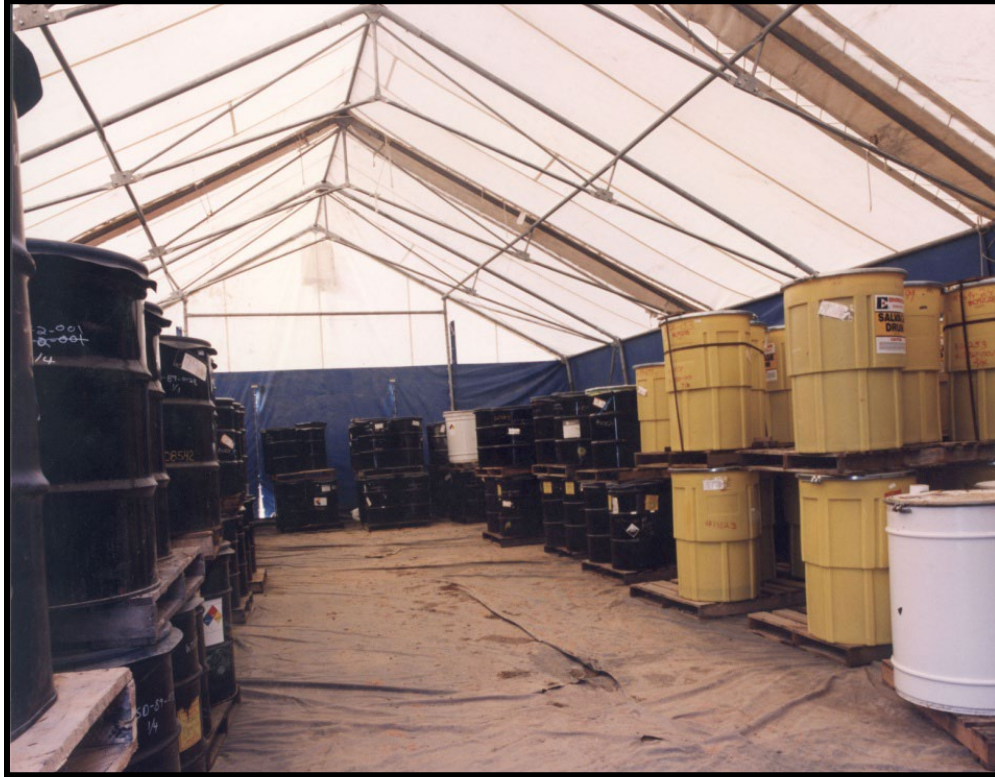
Figure 153. Covered and Secured Storage Area for Containers.