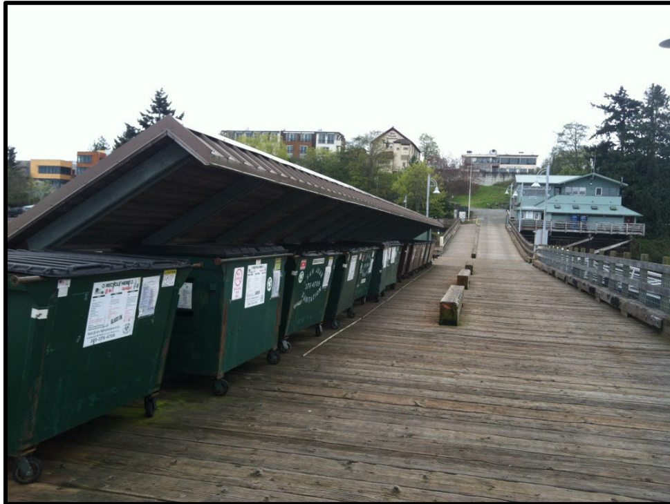
Figure 1. Covered Outdoor Storage of Solid Wastes in Suitable Containers.

damaged or leaking. Store damaged or leaking batteries in a covered, non-leaking secondary containment system. Keep battery acid neutralizing materials, such as baking soda, available near the storage area.