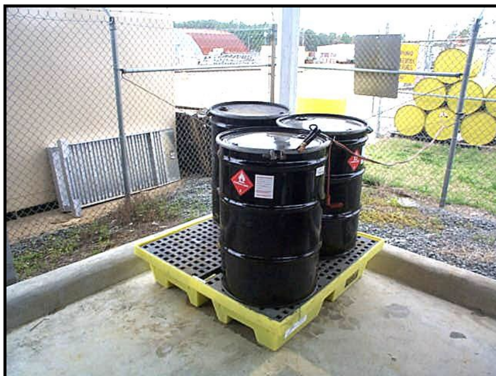
Figure 164. Containers Surrounded by a Berm in an Enclosed Area.