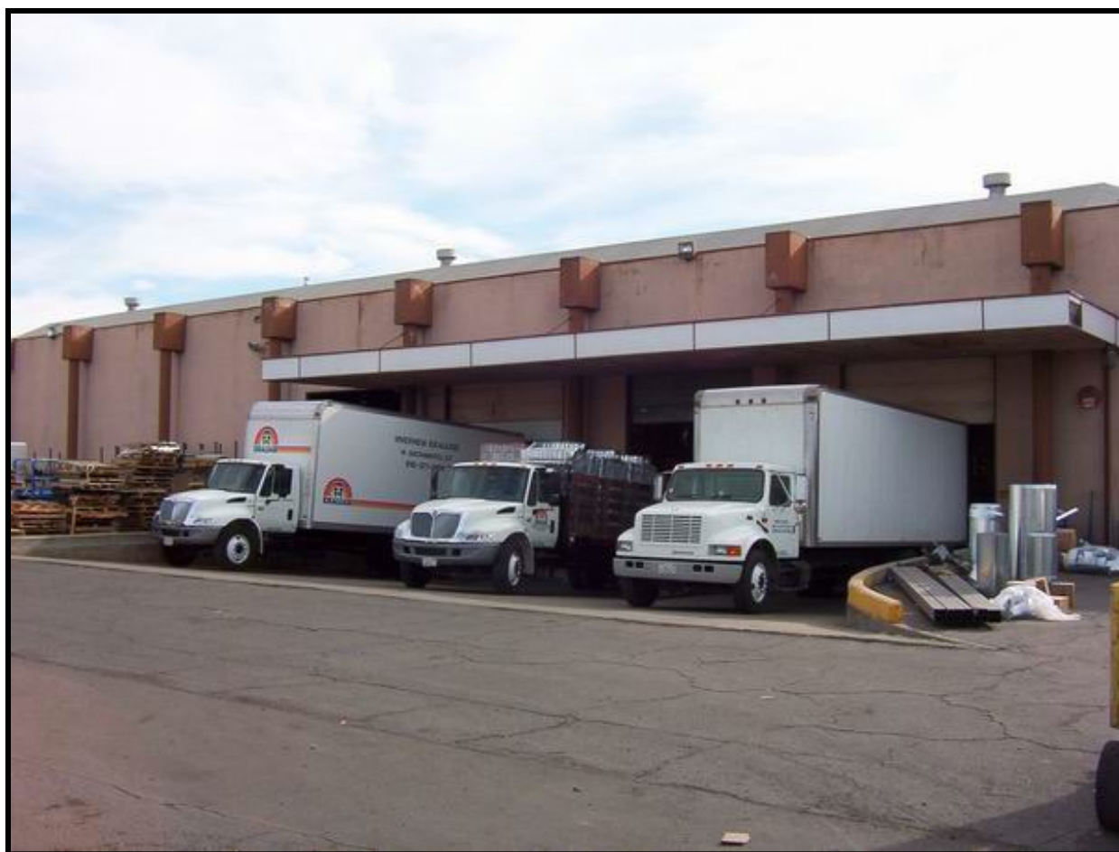
Figure 119. Loading Docks with an Overhang to Prevent Material Contact with Stormwater.

Mobile Fueling of Vehicles and Heavy Equipment (BMP 10) ( Section 2.1.10 ) is recommended in areas of transfer from tanker trucks to aboveground or underground storage tanks; it includes: