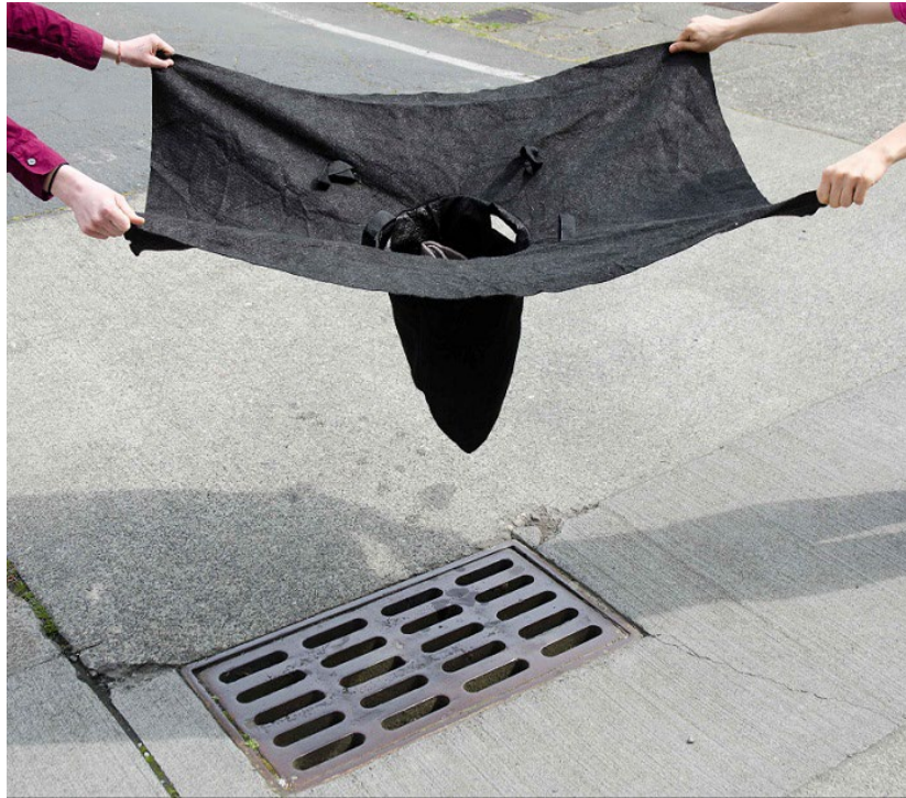
Figure 75. Commercially Available Catch Basin Filter Sock.