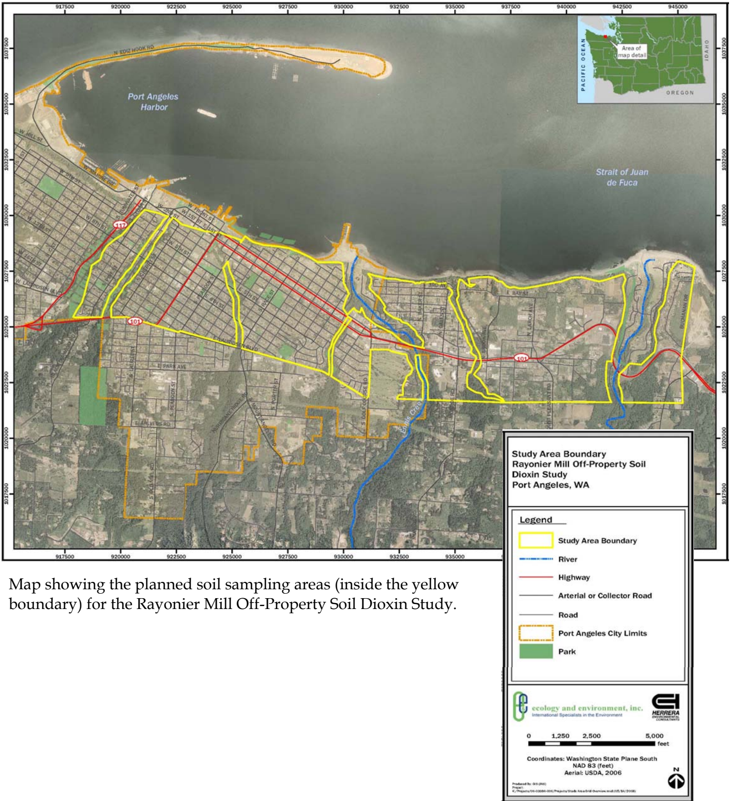
Map showing the planned soil sampling areas (inside the yellow boundary) for the Rayonier Mill Off-Property Soil Dioxin Study.