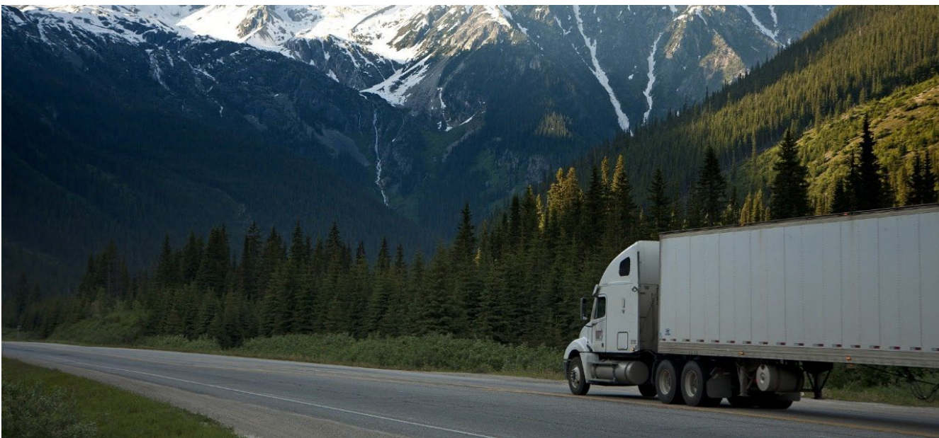
Figure 6: Safely ship your dangerous waste by using a permitted transporter.

It is your responsibility to choose a hazardous waste transporter. Use a permitted transporter with a valid EPA/state ID number. Selecting a company that is financially able to respond to accidents is important; it is your responsibility to ensure your dangerous waste is properly disposed of.