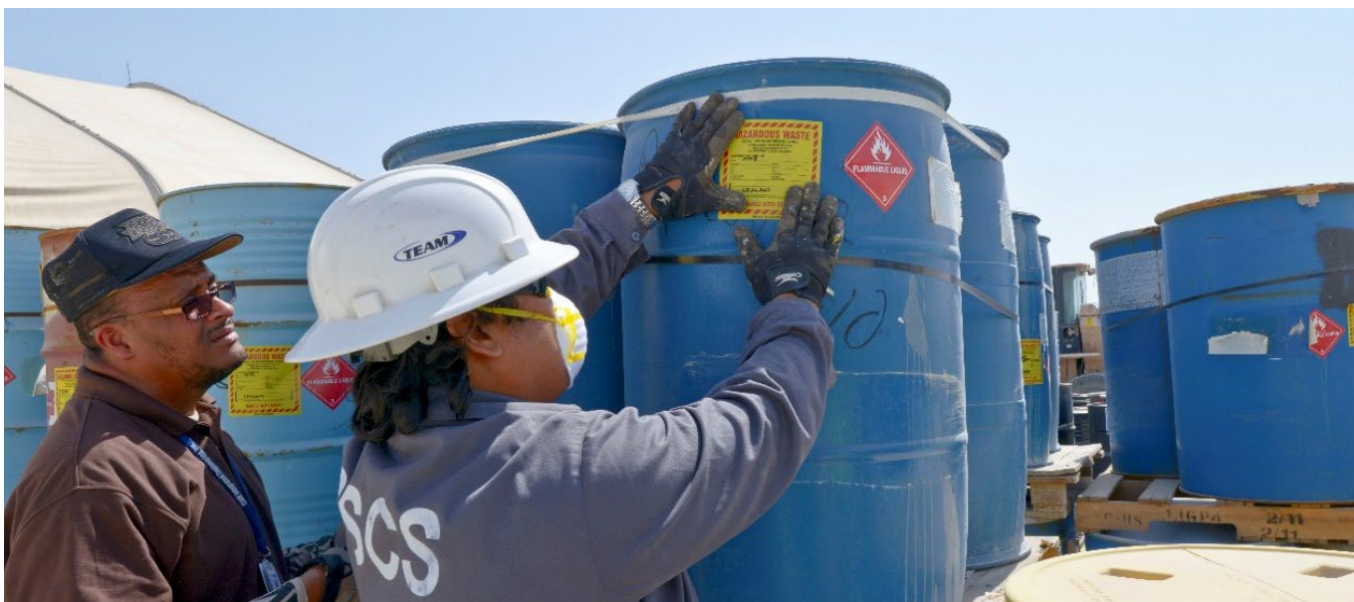
Figure 1: Manage your dangerous waste properly to keep your workers and the environment safe.

Additional information on proper dangerous waste management may be found at the Department of Ecology's Hazardous Waste and Toxics Reduction (HWTR) Program website . 7