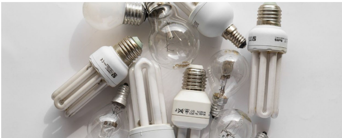
Figure 3: Some used light bulbs are classified as dangerous waste.