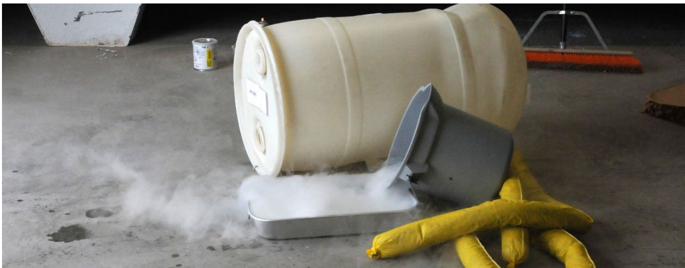
Figure 7: Report all dangerous waste spills immediately.

You must report any spill 30 that endangers human health or the environment, regardless of size. Post emergency contact information near your dangerous waste accumulation areas. Report significant spills and releases to each of the following: