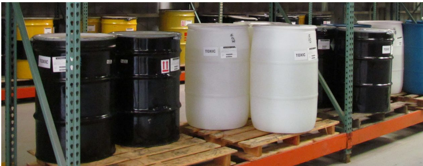
Figure 5: It's your responsibility to inspect your dangerous waste containers regularly.