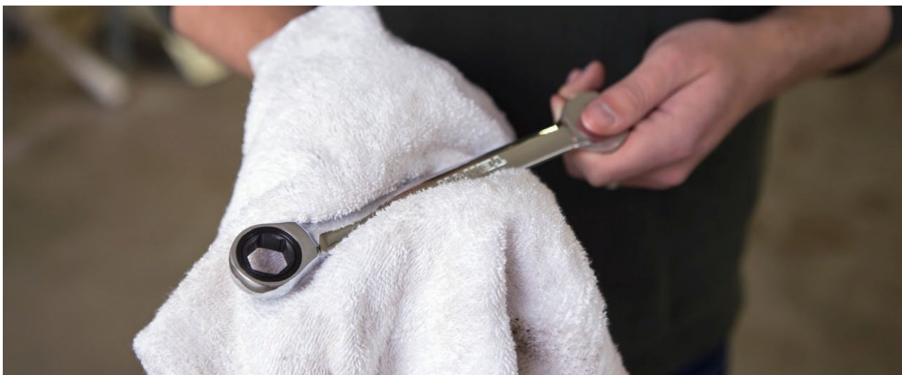
Figure 2: Shop towels can be designated as dangerous waste.