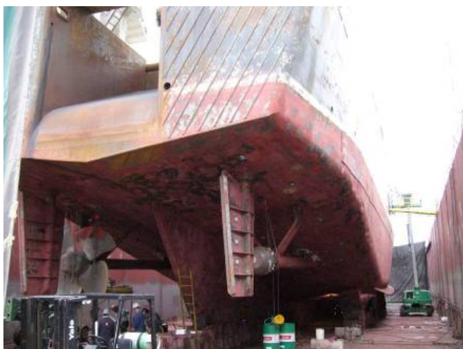
Figure 5 - DEFENDER in dry-dock on May 12, 2006. Light on starboard side under the hull shows location of the fracture and repair.

Ecology investigators visited the DEFENDER in dry-dock at Seattle, Washington, to examine the hull fracture in the starboard main engine day tank. They found the hull plate containing the fracture was already cut from the hull plating and new steel tack-welded in place. The removed section of steel plate was retained by the shipyard and shown to Ecology investigators. Figures 5 through 9 show the DEFENDER in dry-dock, the location of the fracture, the in-progress repair, and the fracture in the steel plate cut from the hull.