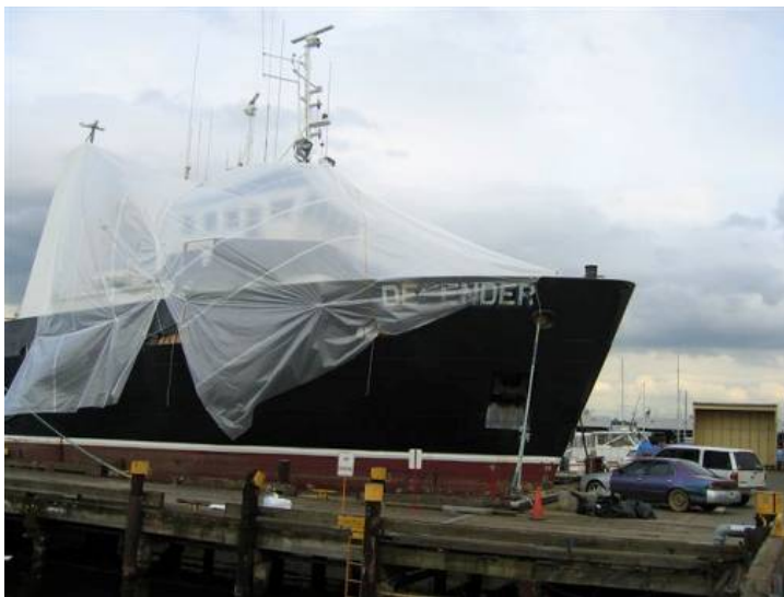
Figure 1 - Fishing vessel DEFENDER at a former shipyard site on March 29, 2006.

On Wednesday, March 29, 2006, at about 1400, the fishing vessel DEFENDER's First Engineer noted oil coming up from below the surface of the water on the ship's starboard side. The DEFENDER had its starboard side against a pier at a former shipyard in Seattle, Washington while conducting an internal transfer of diesel oil. The ship's out-of-service starboard main engine day tank, known to be fractured, was unintentionally filled during the transfer. As a result, about 48 gallons of diesel oil was spilled to waters of Washington State.