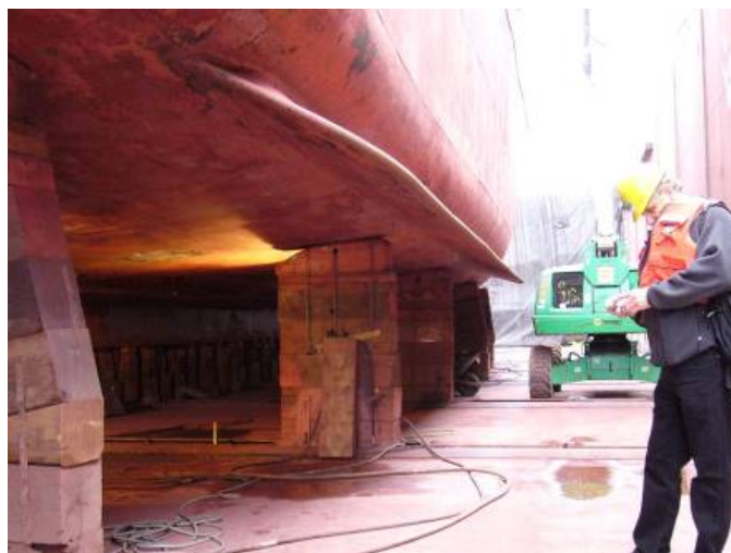
Figure 7 - View of damage location looking forward on the starboard side.