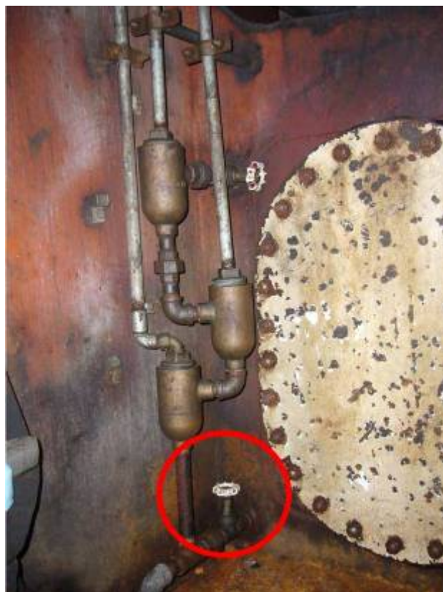
Figure 4 - Photo showing the location of the starboard main engine day tank manual isolation valve.

The starboard main engine day tank manual valve was inspected about a month after the spill. It was found to be closed and in working order (Figure 4). One of the engineers involved in the transfer that resulted in the spill indicated that the valve was only closed after the spill.