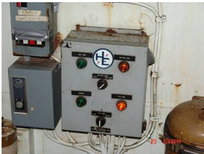
Figure 3 – Control panel for the fuel oil purifier aboard DEFENDER taken March 29, 2006. Note the (upper) switch is in ‘normal’ position but that the top green light (at left) for the larger day tanks is off.

The lower switch was normally set to draw fuel from the fuel oil storage tanks, but could also be set to draw from the fuel oil day tanks. The upper switch was normally set to pump fuel to the larger fuel oil day tanks, but could also be set to pump to the smaller main engine fuel oil day tanks. Both switches also had an automatic setting.