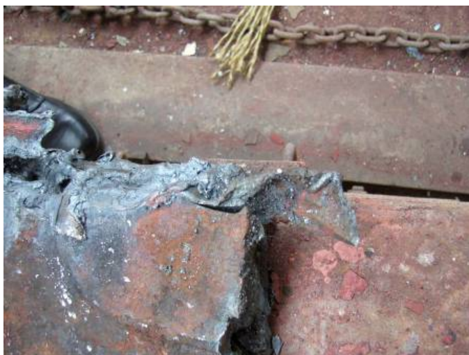
Figure 9 - Close-up of the portion of steel cut from the hull showing the location of a two to three inch fracture through the shell plating and a doubled-up plate used as an attempted repair.

The shipyard master indicated that he found a series of indentations parallel to the keel running fore and aft at the same distance outboard from the keel as the fracture. The shipyard master noted the fore and aft steel stiffeners on the inside of the deformed shell plating were also bent. He believed the dry-dock blocks that were meant mainly to steady