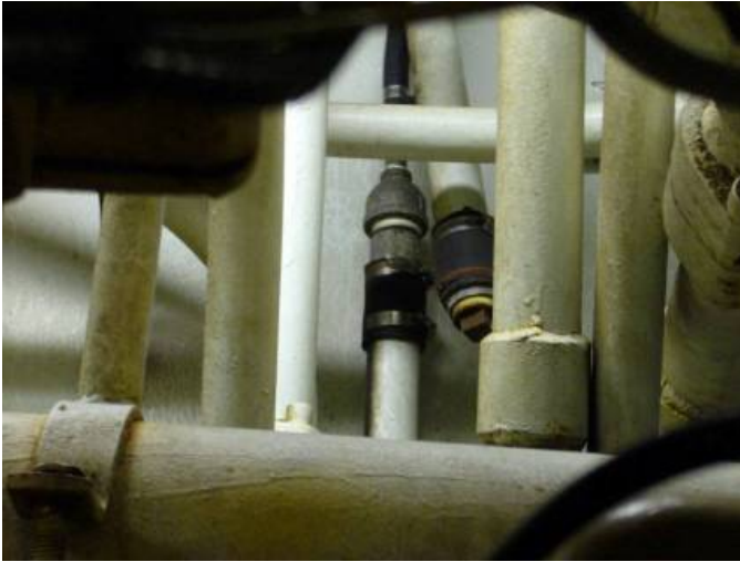
Figure 10. Top of the main engine day tank vent pipe in engine room, starboard side, showing fittings used for injecting compressed air into the tank.

Following the spill it was noted that the upper switch on the purifier panel was not in its normal position. Instead of being set to pump to the larger day tanks, it was set to the smaller main engine day tanks.