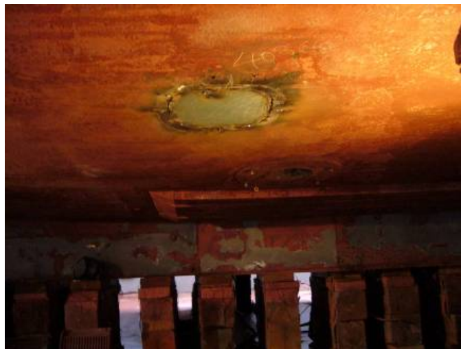
Figure 6. Looking inboard from starboard side at the replacement steel patch that has been tack-welded into place where the fracture had been cut out.