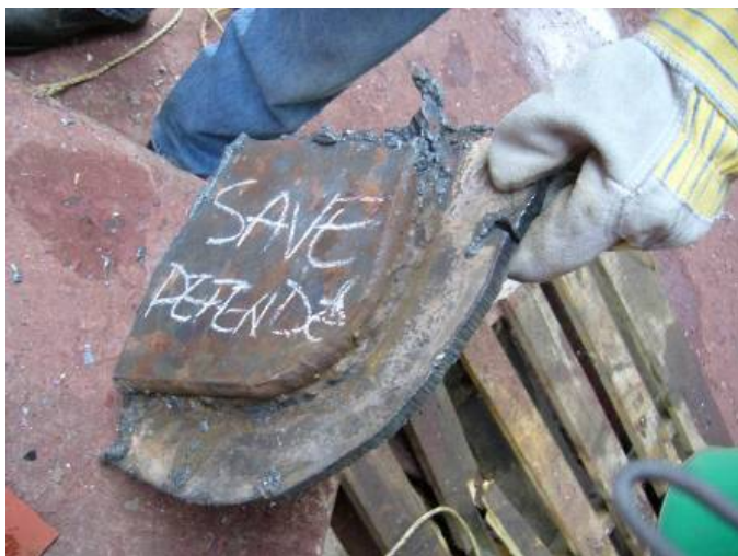
Figure 8 - Retained portion of hull plating.