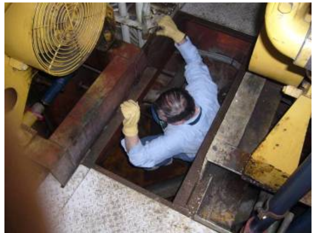
Figure 2 - Access to the starboard main engine day tank just aft of the starboard main engine.

Normally the main engine day tanks overflowed to the larger day tanks. In the case, the starboard main engine day tank overflow line was plugged by the Chief Engineer with an arrangement used to pressurize the tank with compressed air (Figure 10). The tank's vent valve was tied closed.