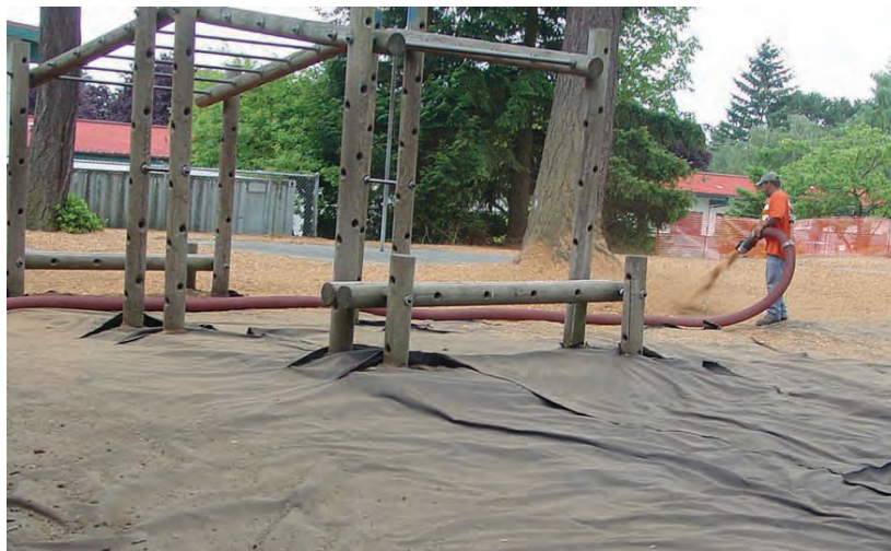
Images 2a and 2b. Covering soil with geotextile fabric and rubber matting or play chips