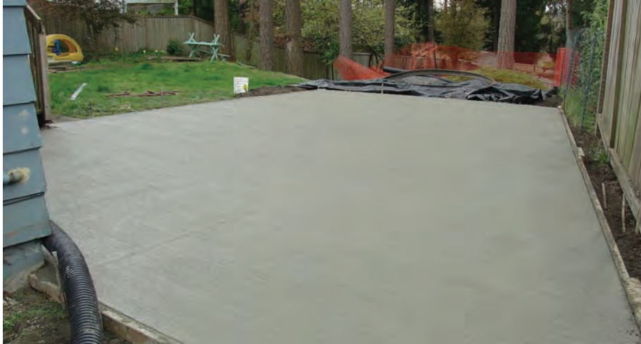
Image 3. Covering contaminated soil with concrete