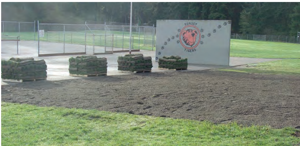
Image 6. Construction activities at Sunset Primary in the University Place School District

Sunset Primary School in the University Place School District had low level contamination on a slope outside of the play structure area. The playground staff did not want children playing on the slope as they were out of visual range. Talking with school staff, Ecology found that installing a low fence would provide a barrier to better define the play area and keep the children from playing in contaminated soil. The soil safety action plan also included soil removal and replacement with a covering of sod in an additional area with elevated levels (see Images 5 and 6).