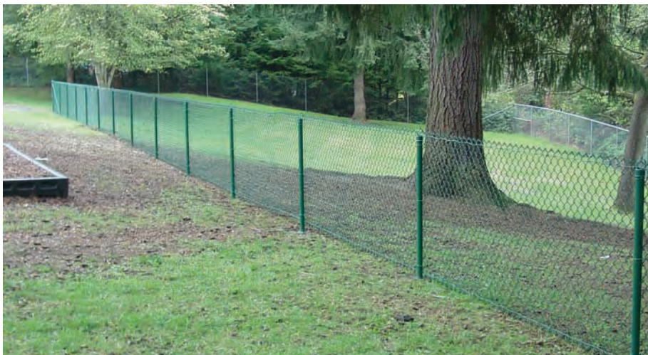
Image 5. Fencing off area with contaminated soil