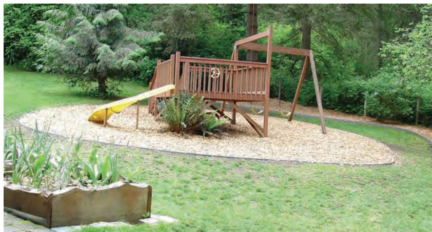
Image 7c. Wood chips added under play structures