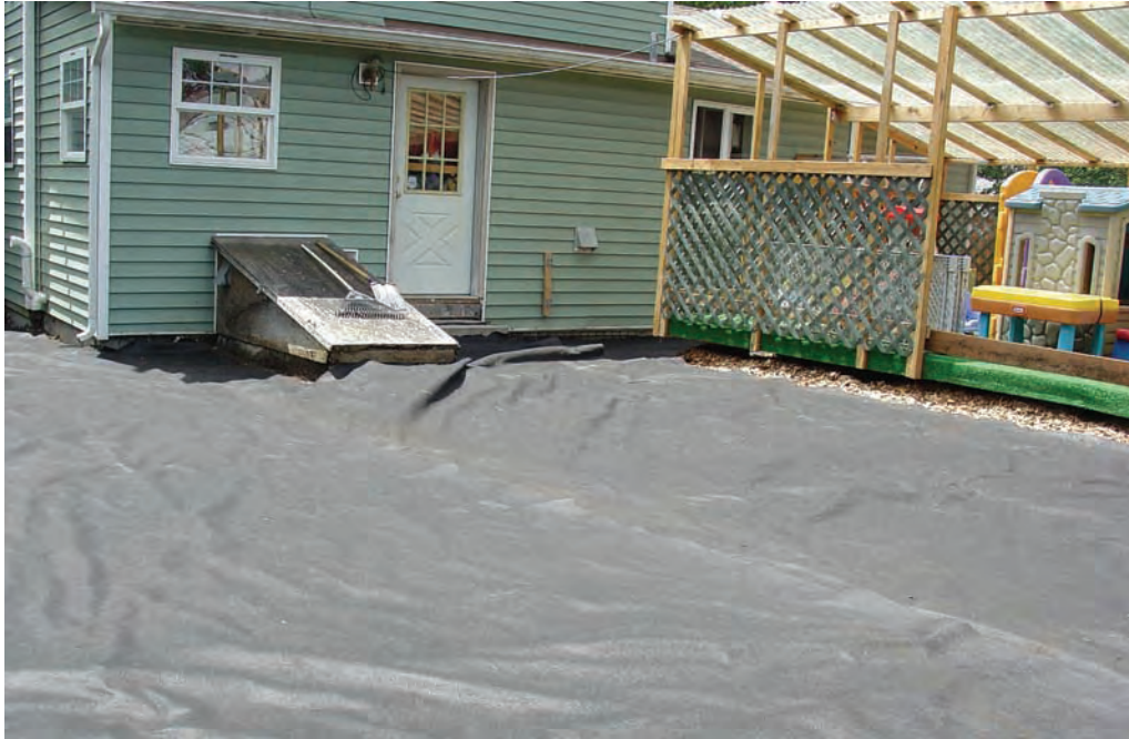
Image 10a. Geotextile barrier placed over soil

started outreach within days of receiving the results. Ecology completed construction activities 36 days after receiving the sampling results. This property had soil removal, geotextile fabric and play chips throughout the play area (see Images 10a and 10b).