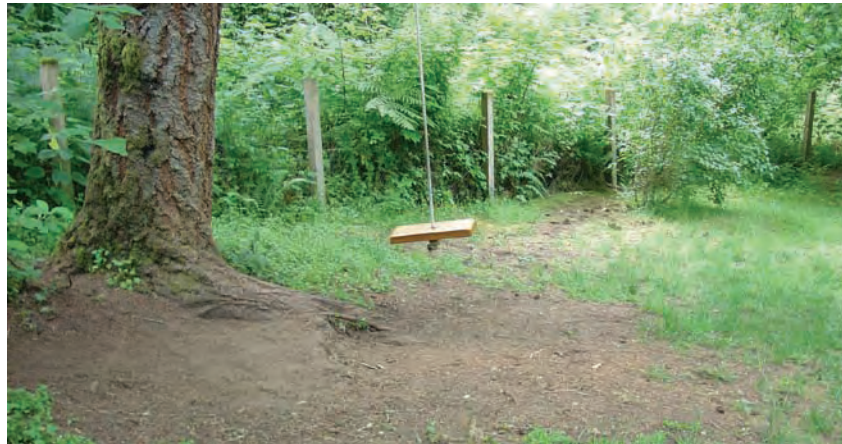
Image 7a. Vashon Island private school yard before soil safety actions

Property owners at two private schools on Vashon Island did not want major soil removal. Ecology worked with these schools to develop soil safety action plans that gave the children clean areas to play around play equipment, while leaving some soil contamination on the property (see Images 7a-c). At both sites, hand washing and shoe removal are routine since some contamination remains in the play areas.