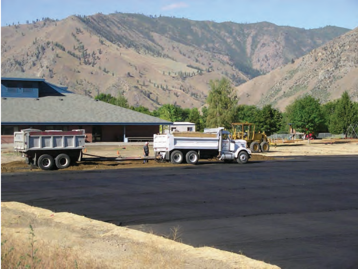
Image 13. Soil capping at Orondo School District, Douglas County

Limited soil excavation was used for several schools prior to deep mixing. Widespread soil excavation down to the depth of contamination (typically, between one and one and a half feet below grade) was only used at one school—Manson Elementary.