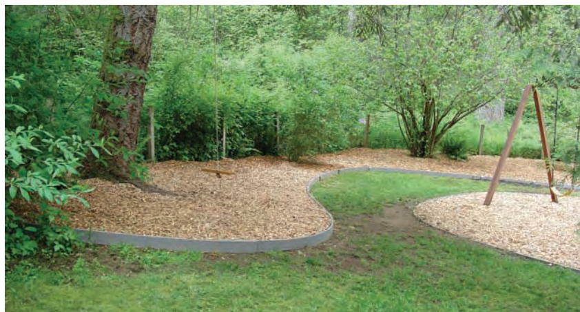
Image 7b. After soil safety actions