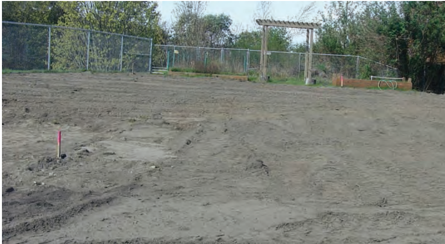
Image 4. Mixing contaminated soil with clean soil