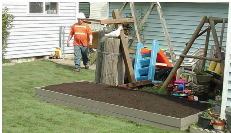
Image 11b. Raised garden bed at childcare C