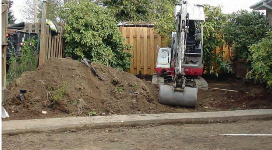
Image 1. Removal of the top six inches of contaminated soil