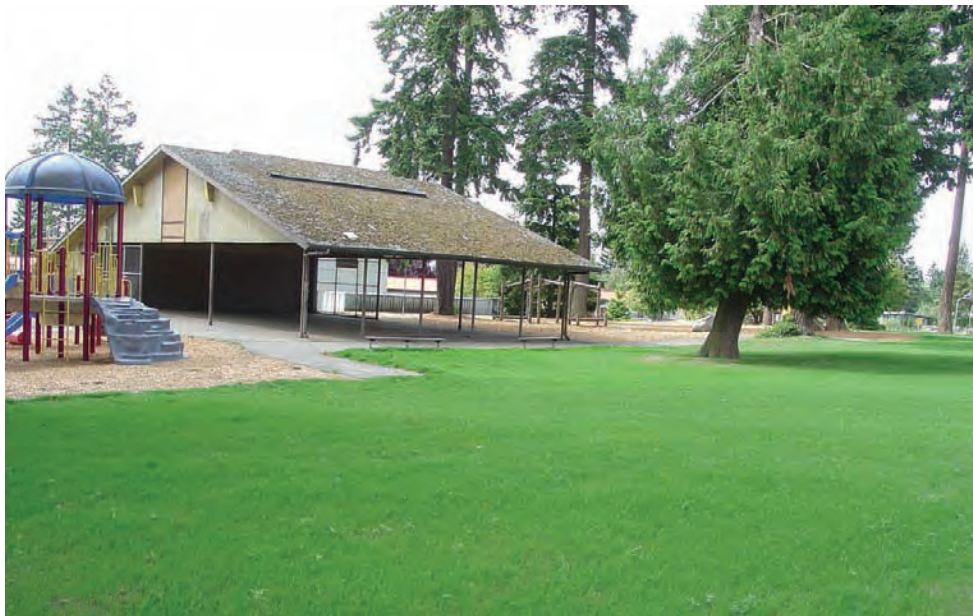
Image 9b. After soil safety actions