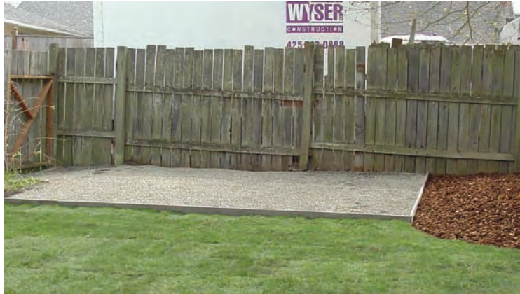
Image 11a. Pea gravel bed at childcare C

Most childcares, due to the structure of their play areas, require more than one method of construction. Three childcares in Tacoma, needed different approaches for each different play areas. All three childcares required soil removal and replacement covered with sod. Childcares A and B required geotextile fabric and play chips around play structures while childcare C preferred pea gravel (Image 11a). Childcare C needed a raised garden box to enable the children to garden (Image 11b) Childcare A also needed a fence to keep toddlers out of the soil around the bushes (Image 11c).