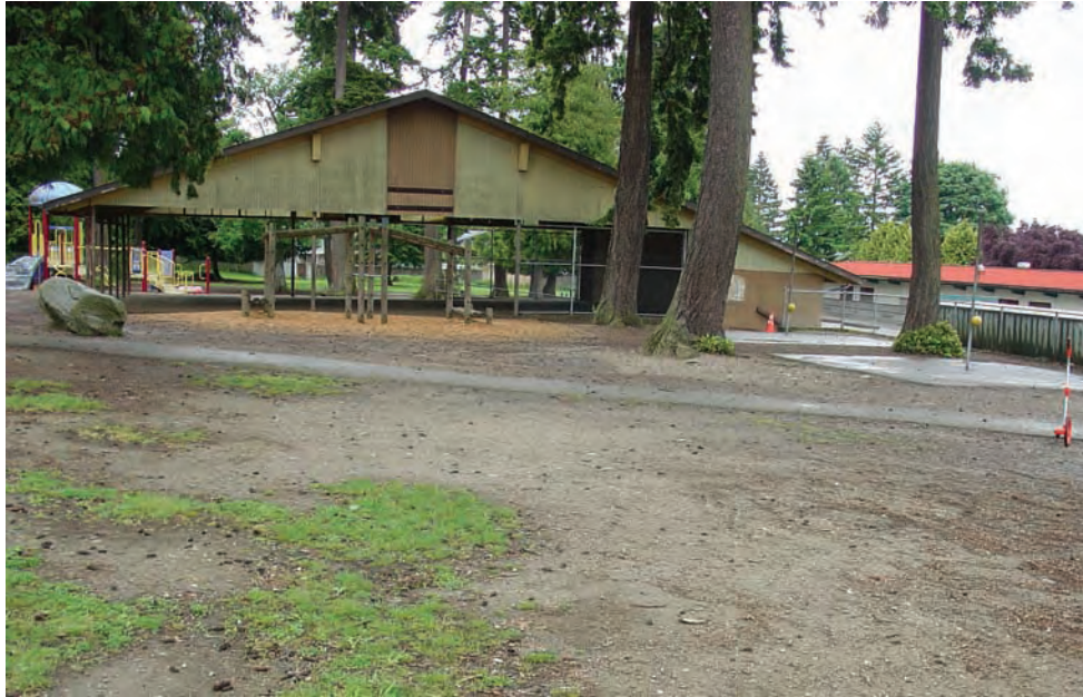
Image 9a. Star Lake Elementary before soil safety actions

Star Lake Elementary, in the Federal Way Public School District, had high and moderate levels of arsenic in the play field and areas surrounding the play equipment. Ecology worked with the district to remove the top six inches of soil over the portion of the play area with contamination. Clean soil was laid in the field and covered in hydroseed. In the areas with play equipment, geotextile fabric was laid and covered in twelve inches of play chips (see Images 2 and 9a-b).