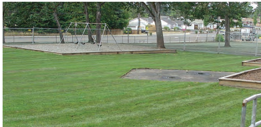
Image 8c. After soil safety actions