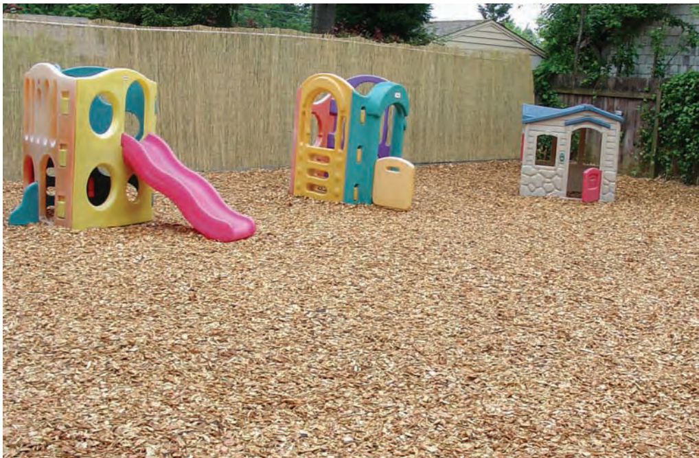
Image 10b. Play chips in the finished play area