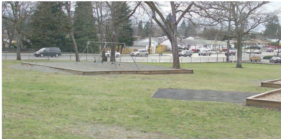
Image 8a. Custer Elementary before soil safety actions

Custer Elementary, in the Clover Park School District, had low levels of arsenic over the entire play area. Ecology worked with the school district to remove the top six inches of soil over the entire play area. This project began in the summer and completed before the start of school. Clean soil was brought in and covered with sod and hydroseed. The school district then planned a watering schedule that would maintain the sod and start the seed. (See Images 8a-c)