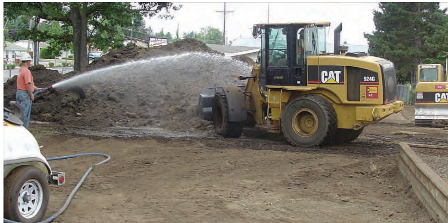
Image 8b. Soil removal and watering to control dust