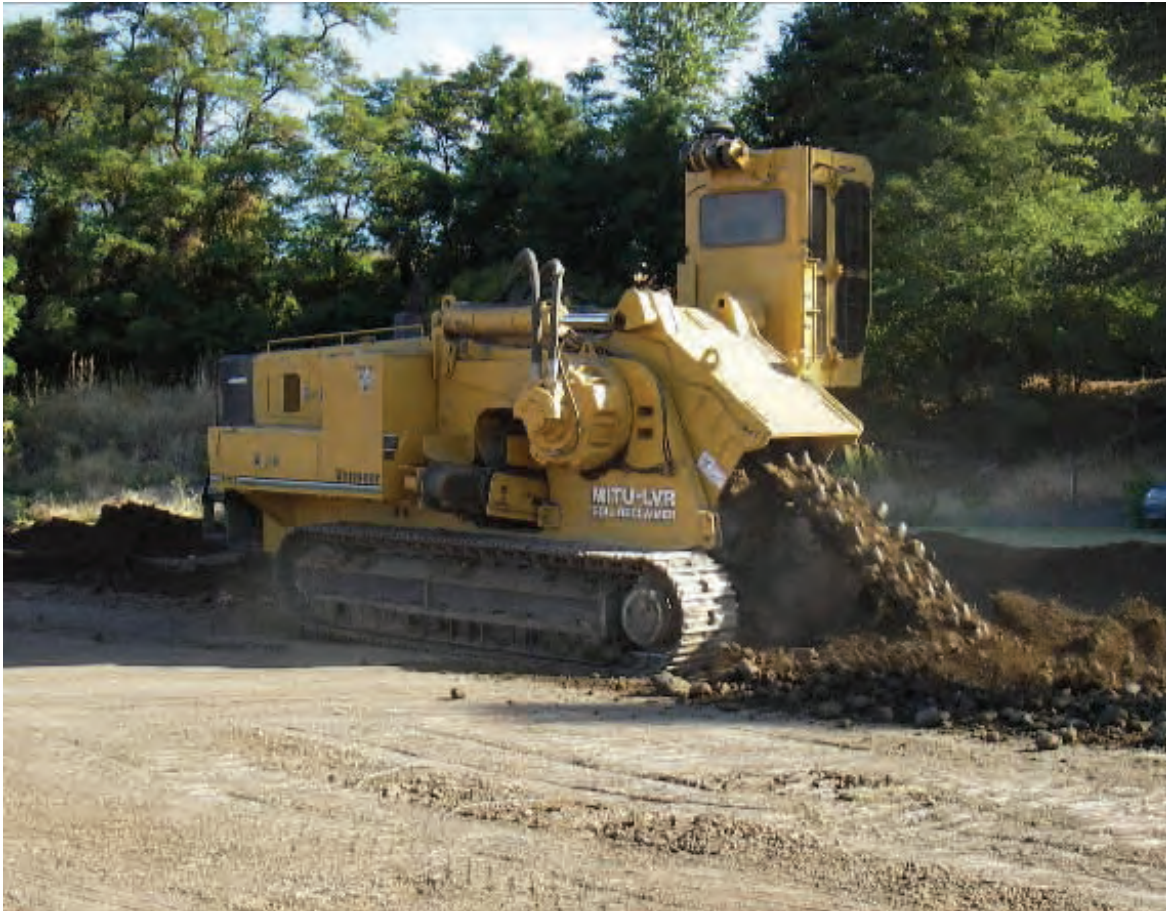
Image 12. Deep mixing at Naches Intermediate School, Yakima County

Ecology used a variety of cleanup methods to address the lead and arsenic contamination. These included widespread soil excavation, limited soil excavation, soil capping, and deep mixing. The cleanup method was determined after assessing the geology of the site and the distribution of contamination throughout the soil profile (depths of soil). In 2006, many of the cleanups utilized innovative deep mixing technology. This technology allowed for the clean, deep soil to be mixed with the contaminated soil near the surface (see Image 12). While deep mixing allowed for a permanent cleanup of contamination, it was generally not useful at schools with arsenic levels above 100 mg/kg.