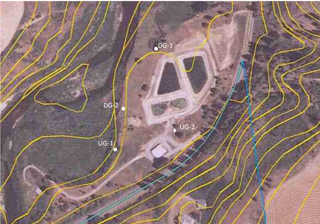
Figure 3. Monitor well locations at the Hangman Hills Sewage Treatment Plant.

A thermal profile of the hyporheic zone will be conducted using a thermal probe and measuring at specific intervals along the zones of interest.