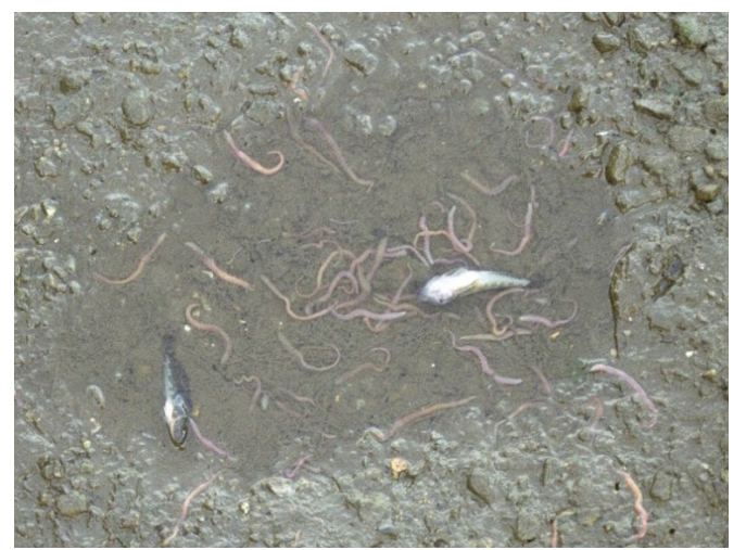
Dead fish and worms from a gasoline spill in Whatcom Creek.