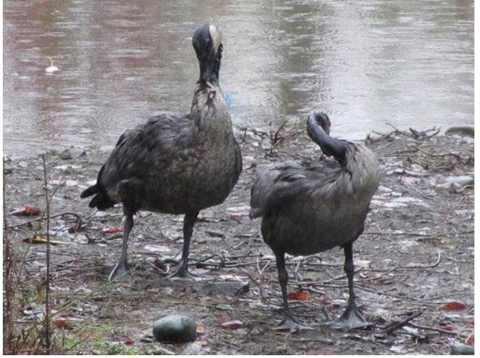
Birds coated in canola oil from the White Center Pond spill, November 2015.

Gasoline, AvGas, and naphthas are not viscous and present practically no mechanical injury threat. Large quantities could cause loss of insulation, but toxicity would likely result in death before hypothermia.