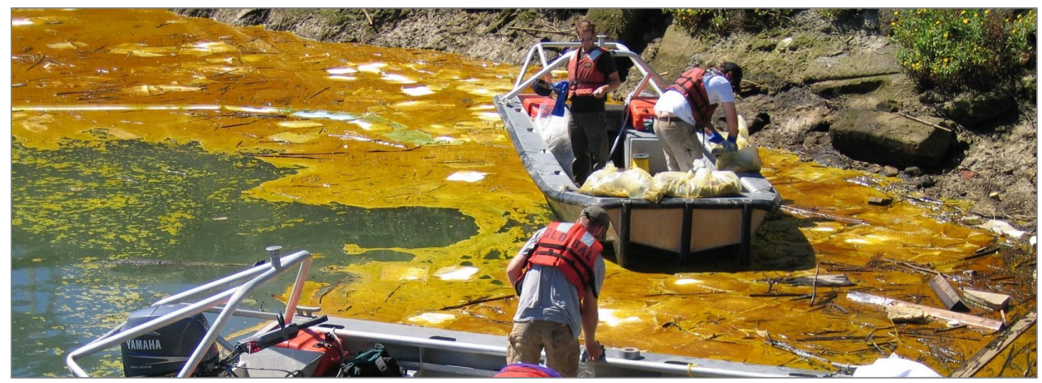
Oil spills harm organisms and their habitats. Here, a large biodiesel fuel spill is coating debris and shoreline.