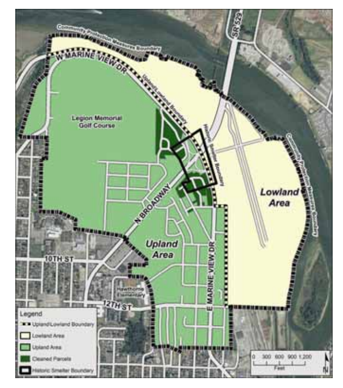
Everett Smelter Cleanup Area

Asarco declared bankruptcy in 2005. A bankruptcy court resolved Asarco's liability in December 2009 and the State of Washington received a settlement of $188 million for several contaminated sites. The Everett site received $44 million which will be used to fund continuing cleanup activities near the former smelter. There will be no cost to property owners or to taxpayers for the cleanup.