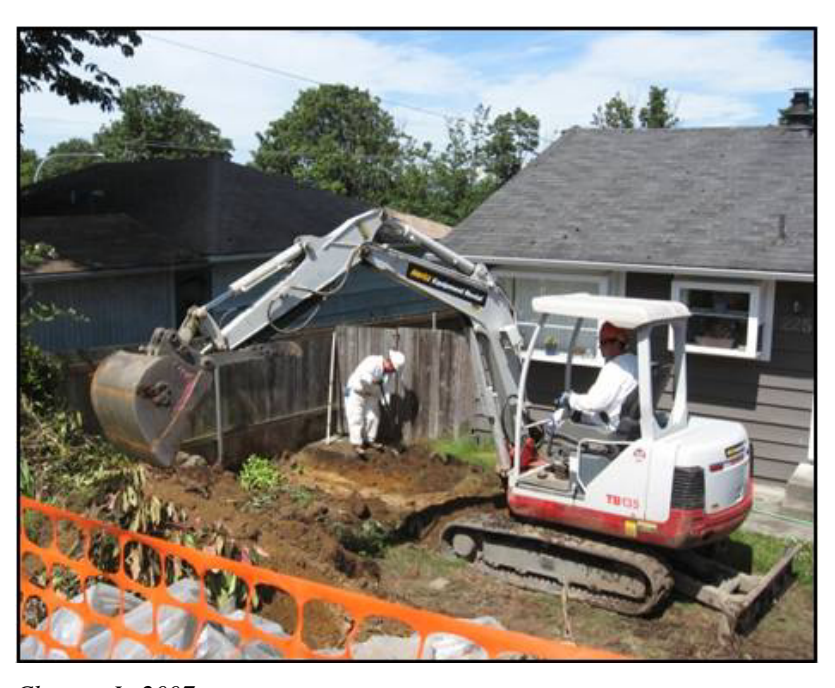
Cleanup In 2007