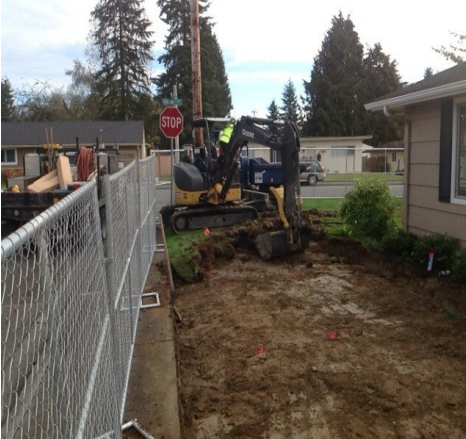
Figure 3. Removing Contaminated Soil

These practices include dust control, load covering, and regular street sweeping with a vacuum truck.