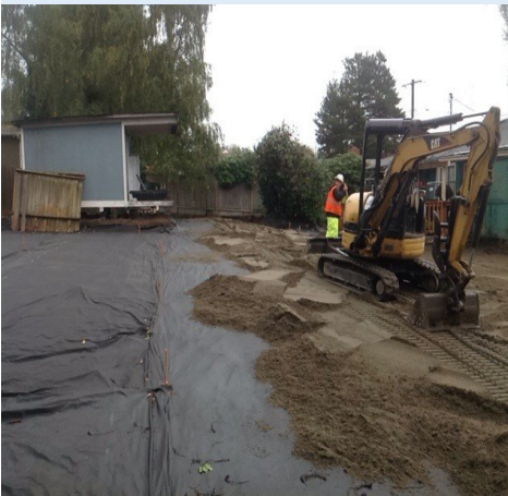
Figure 4. Adding Clean Soil

We will inspect your property once after cleanup is complete, and again one year after cleanup. After the inspection, we will address landscaping issues that remain.