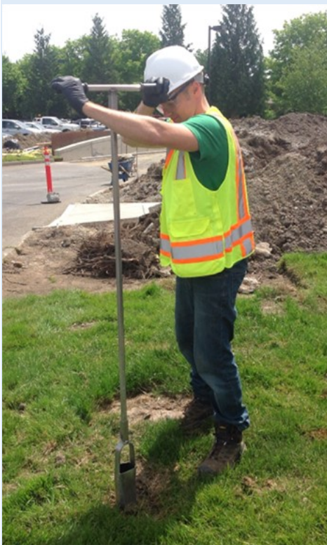
Figure 6. Soil Sampling