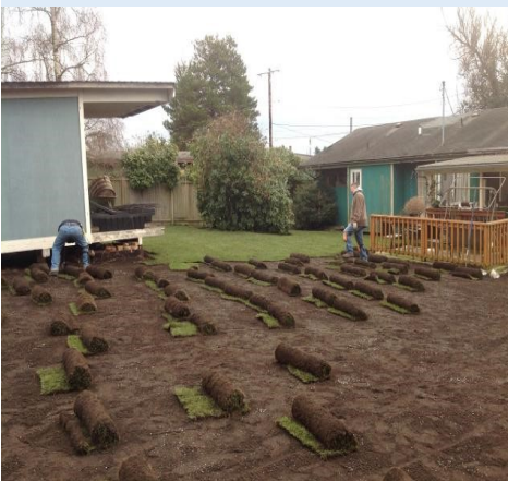
Figure 5. Restoring Grass and Landscape Plants

Ecology provides oversight of the contractor during the work. We will work with each property owner to identify any damage that may have occurred. We will work with the contractor to make sure the damage is repaired.