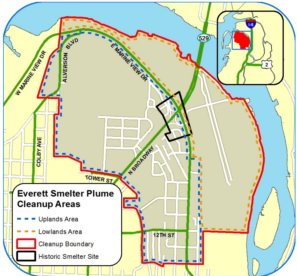
Figure 1. Everett Smelter Cleanup Site

The cleanup site is divided into Upland (residential) and Lowland (industrial/commercial) cleanup areas. The two areas are on different cleanup schedules.