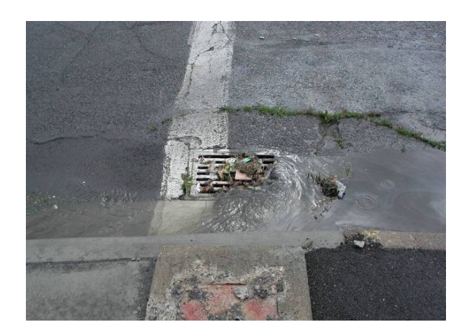
A typical storm drain with dirt and debris that winds up in lakes, streams and rivers.

Stormwater – or polluted runoff – is what results when it rains hard or during a fast snow melt. The water carries pollution on the land into downstream waters. Stormwater is a leading contributor to toxic pollution problems in the Spokane River.