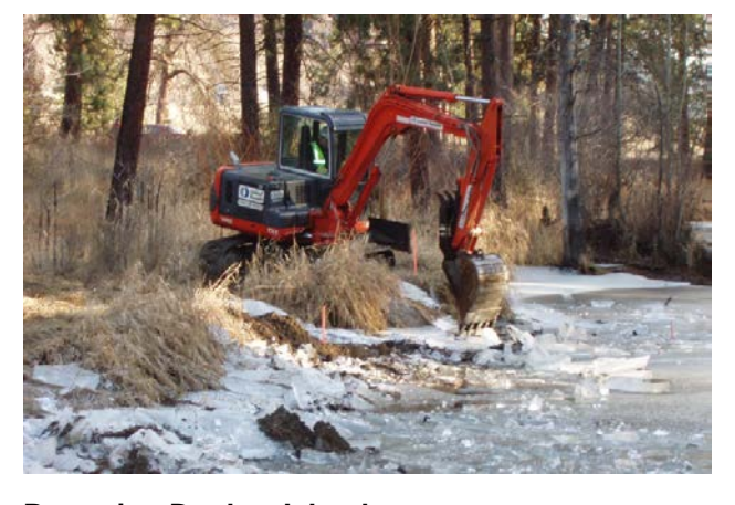
Restoring Donkey Island

backwater channels found on the north bank of the river. Ecology provided oversight as