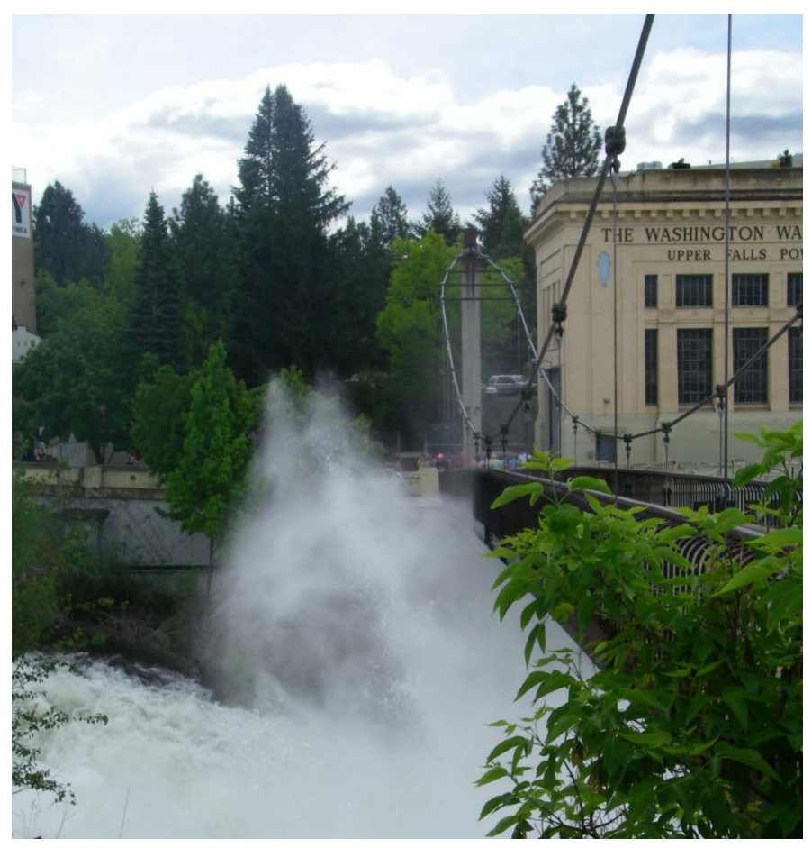
The river at the old Washington Water Power site in downtown Spokane

The major elements of Ecology's toxics reduction strategy are described below, including efforts by the Environmental Assessment, Urban Waters, Water Quality, Toxics Cleanup, and Hazardous Waste and Toxics Reduction programs. The strategy elements include keeping up-to-date with the science, learning from where the toxics are coming, and reducing those upland sources. Other elements include writing new permits for industrial and municipal dischargers and more on-the-ground cleanup work on the beaches or upland sites where toxic pollutants are a threat to the Spokane River.