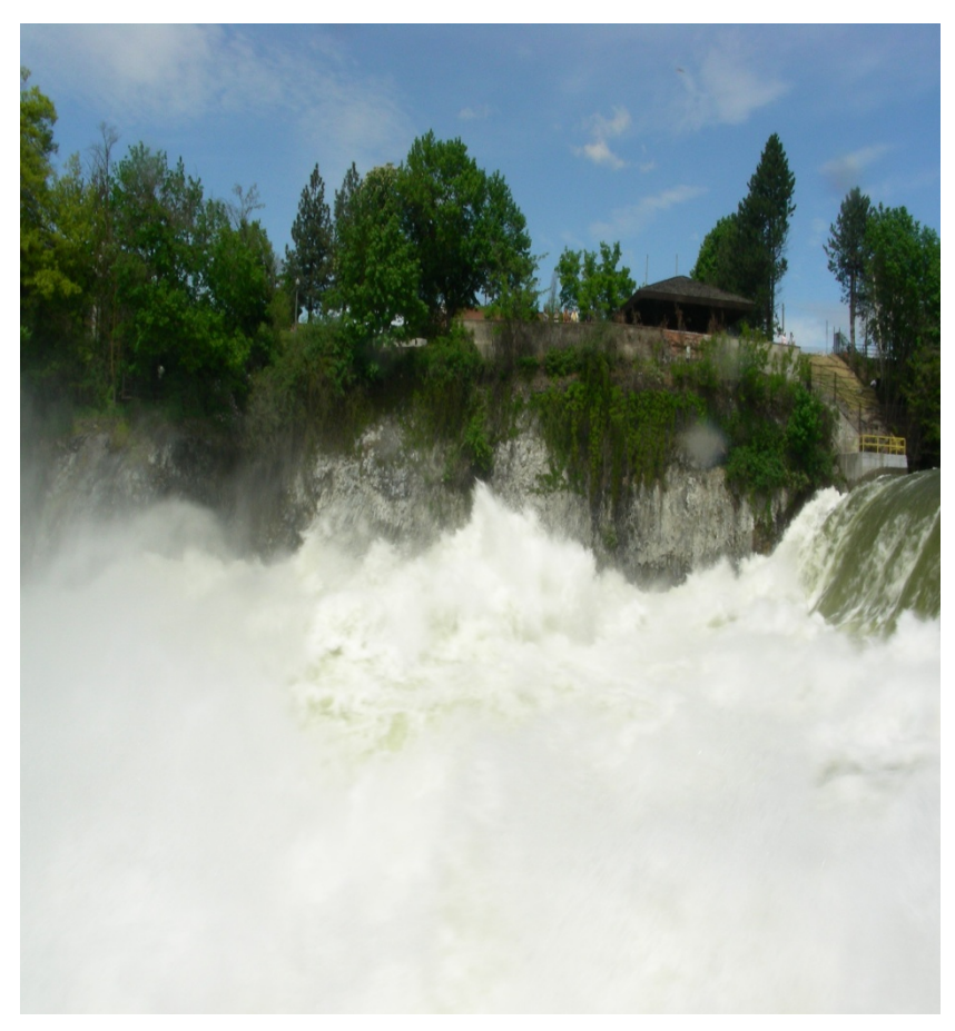
Spokane Falls in the middle of the city during spring runoff