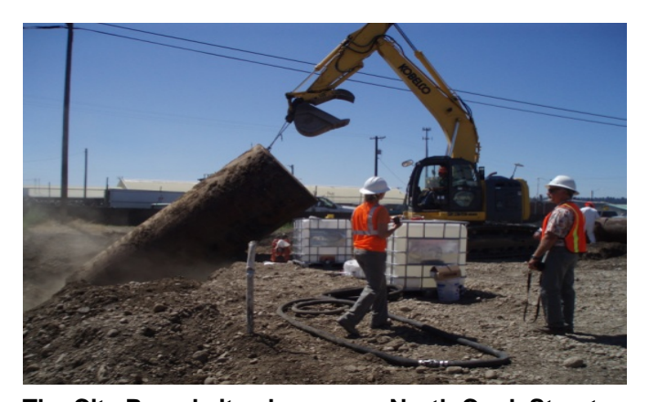
The City Parcel site cleanup on North Cook Street

Other projects have been undertaken to reduce PCBs in the environment. The following are examples of projects in the Spokane area that re either adjacent to the river or could affect the river because of contaminated groundwater or contaminated stormwater runoff.