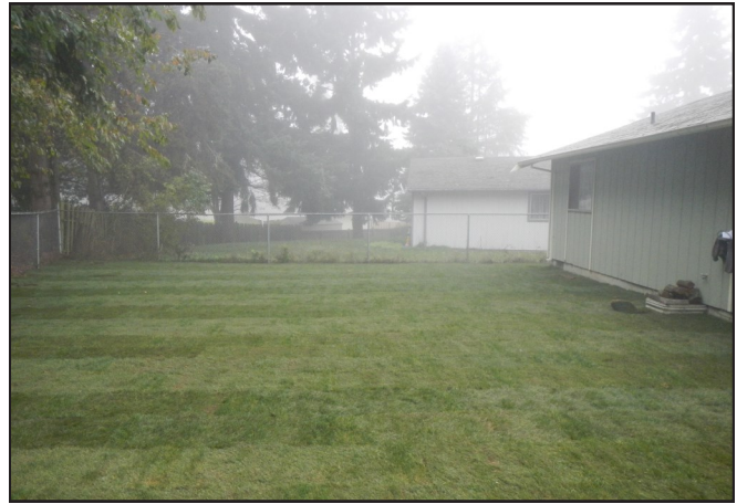
Sod is installed to replace the lawn area.

Some plants can be removed, transplanted or replaced with nursery plants. The contractor will use either sod or hydro seed to replace lawn areas. Immediately after installation, the contractor will maintain the new lawn for 60 days.