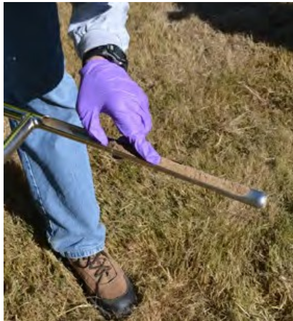
2. Taking the soil sample out of the tool.