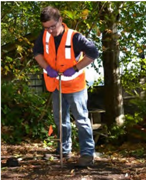
1. Boring a hole with a sampling tool

Each yard will be divided into 1 to 4 units. For lots over a quarter acre, we will work with you to identify the areas you use the most—"high use areas." These may include a play area, lawn, or garden bed.