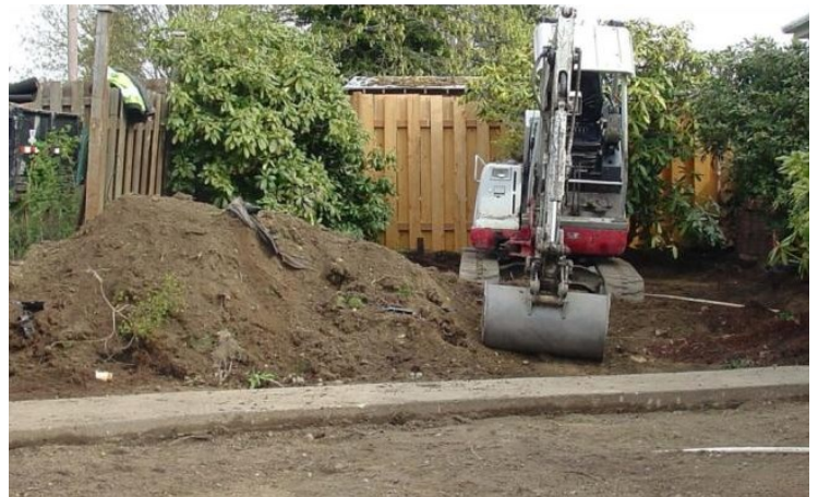
Digging out contaminated dirt from a yard