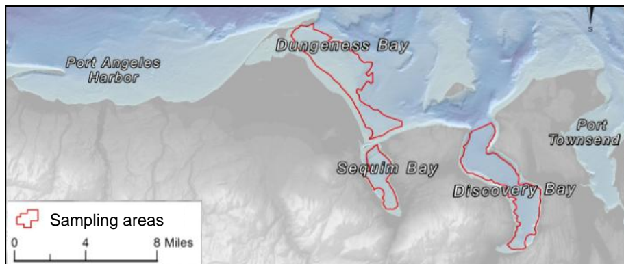
North Olympic Peninsula regional background sampling areas

We will finalize the plan in late April and do sampling in early summer 2013. We plan to make the sampling data report available late this year.