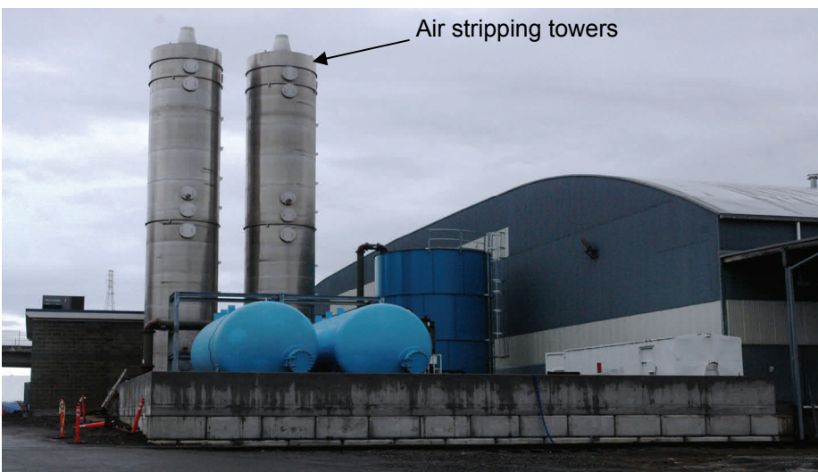
Groundwater pump and treat, and air stripping system

The port began operating a new groundwater pump and treat system in 2009. It removes trichloroethylene (TCE) and other contaminants from groundwater using air stripping. Ecology's website (page 1) has a fact sheet on how the air stripping system works.