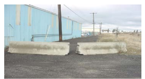
Alleyway East of Former Building

surface. Contaminated soil was located in the gravel parking area on the north side of the building and in the alleyway east of the property