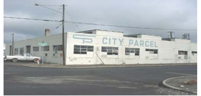
Former City Parcel Building at the corner of Cook Street and Springfield Avenue

Access to the property north of the City Parcel site has been obtained and Ecology will begin sampling after public comment has been considered.