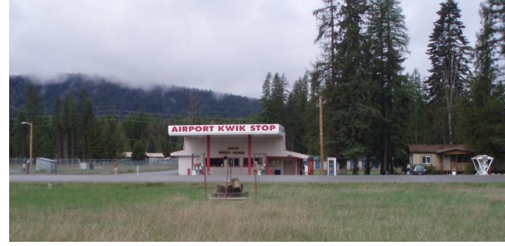
Airport Kwik Stop Site

The site begins west of Highway 31 and north of Greenhouse Road and extends generally east and southeast toward the river in Ione, Pend Oreille County, Washington (Fig. 1).