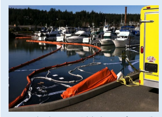
Boom and sorbent material deployment from trailer, Shelter Bay Marina Fire, 2014, La Conner.