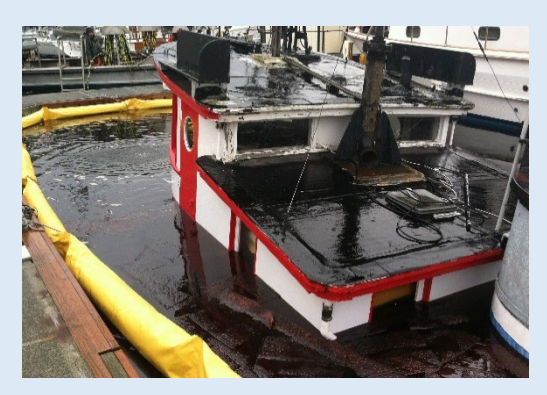
Tug Chickamauga sinking and diesel spill, Bainbridge Island, 2013.