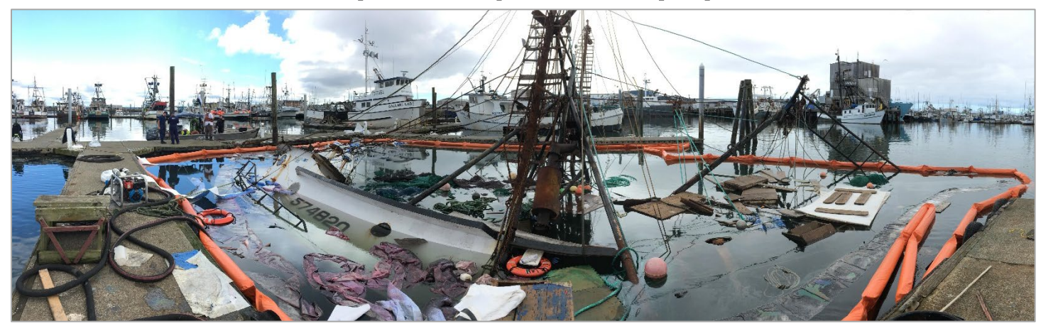
Fishing vessel Lady Lilian sinking and spill, 2016, Westport, Wash.