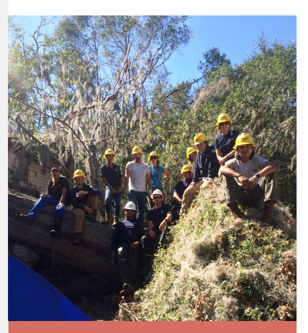
WCC members gather after a long day of service clearing debris from areas affected by Hurricane Matthew.