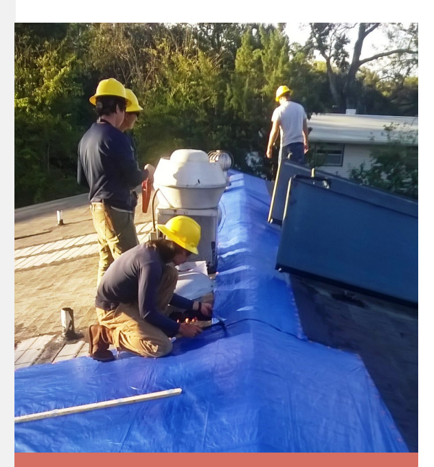
WCC members perform tarping on a residential roof.