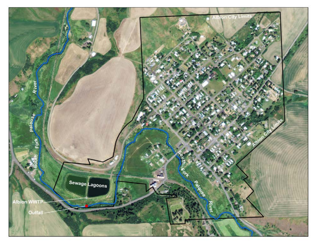
Figure 1. Study Area for the Albion Wastewater Treatment Plant PCB and Dieldrin Study.