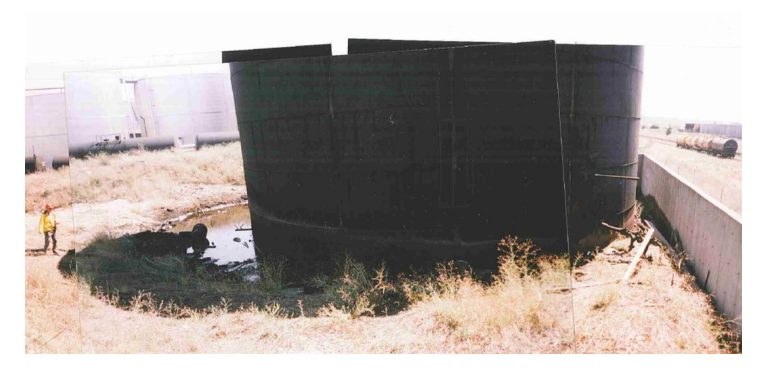
Figure 2. The BNSF black tank around 1999. The tank stored petroleum products until 2006 when it was emptied and removed.

Then, we will use our assessment of the RI/FS and public input to draft a cleanup action plan. The draft plan will be available for public review and comment before becoming final.