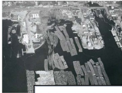
Roeder Avenue Landfill Construction