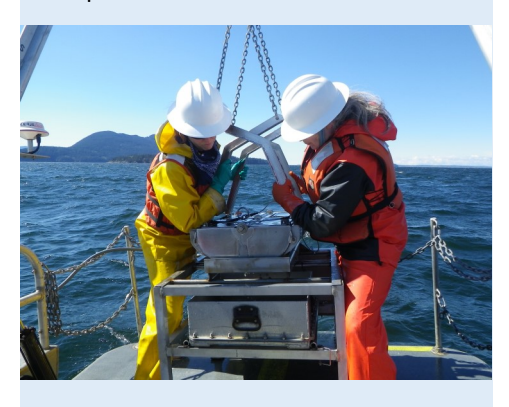
Taxonomist identifying marine benthic invertebrates.

Ecology scientists deploying grab sampler to collect surface sediments.