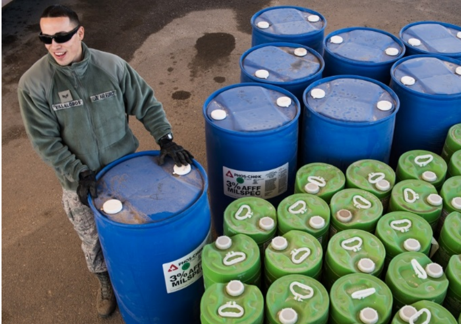
Figure 4. A U.S. Air Force firefighter moves a 55-gallon drum of fire retardant foam. The unit switched all fire retardant foam to a more environmentally friendly foam. 13