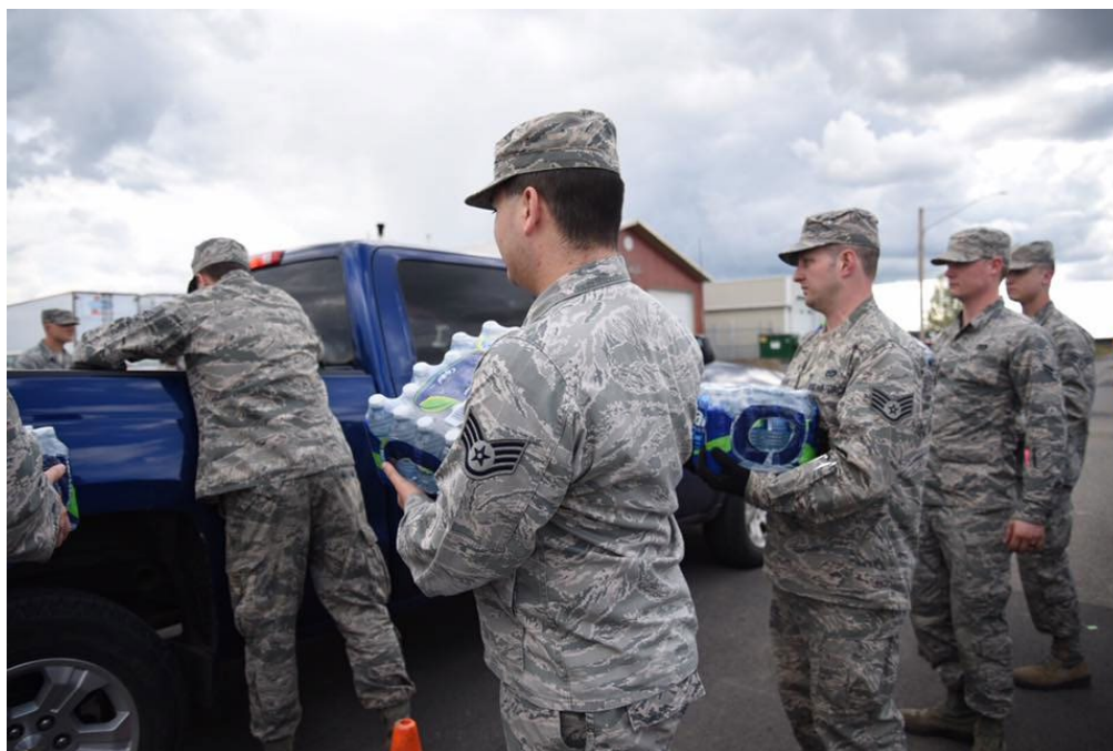
Figure 3. The U.S. Air Force distributes water to Airway Heights residents after town water system is contaminated by PFAS. 10

PFAS testing of public and private drinking water wells in Washington has confirmed the presence of PFOA and PFOS above EPA's health advisory level of 70 ppt (EPA 2017, Carabajal 2017, Hu et al. 2016, Issaquah 2018, NASWI 2016). This groundwater contamination is believed to have resulted from nearby use of AFFF.