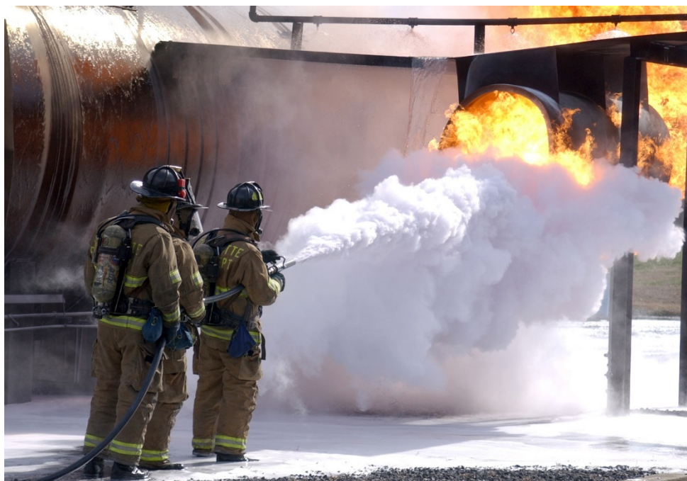
Figure 2. Firefighters from the 916th Air Force Reserve Fire Protection Flight fight a fire during an exercise on a mock fuselage. 9